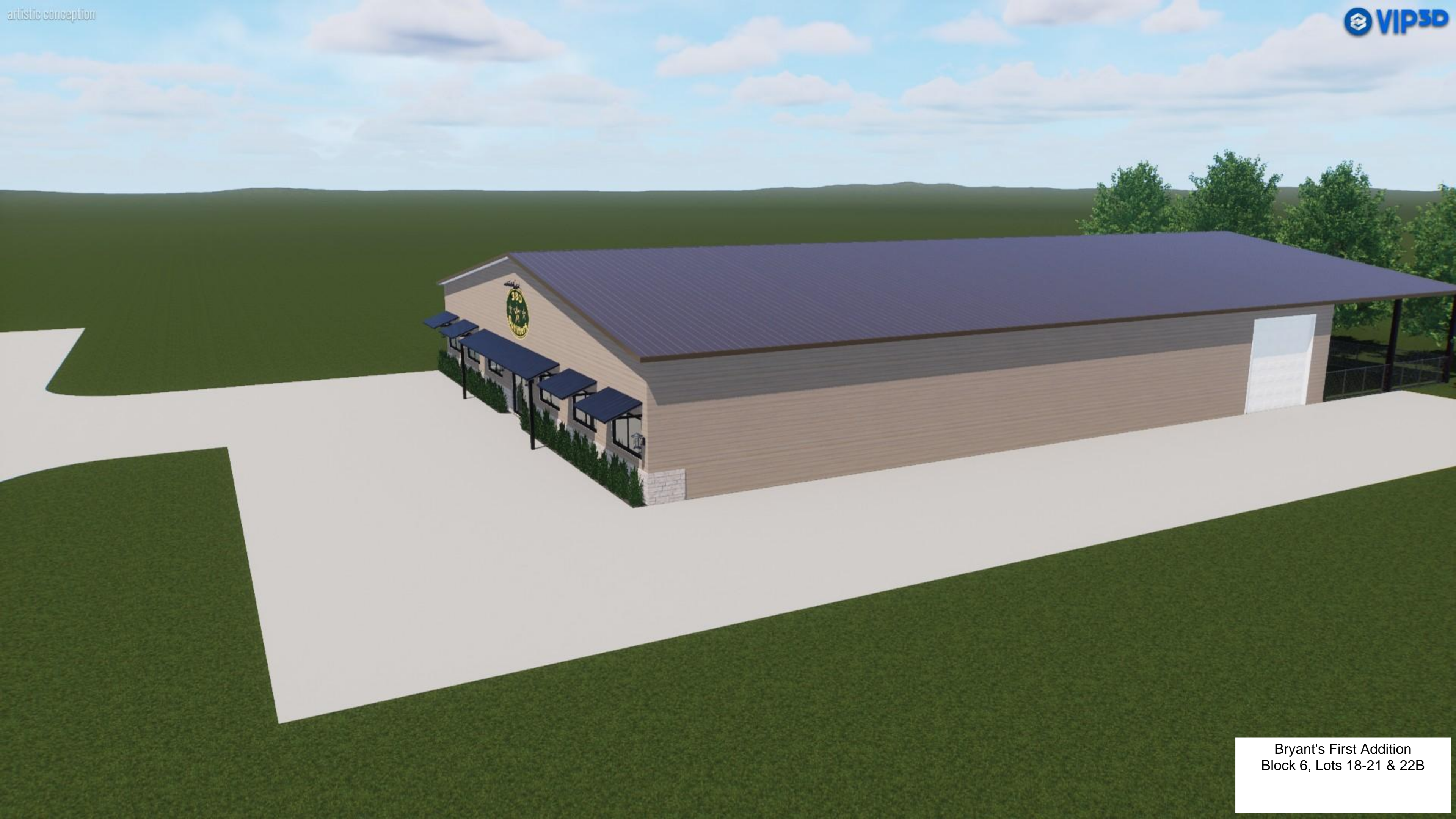
Bryant's First Addition Block 6, Lots 18-21 & 22B