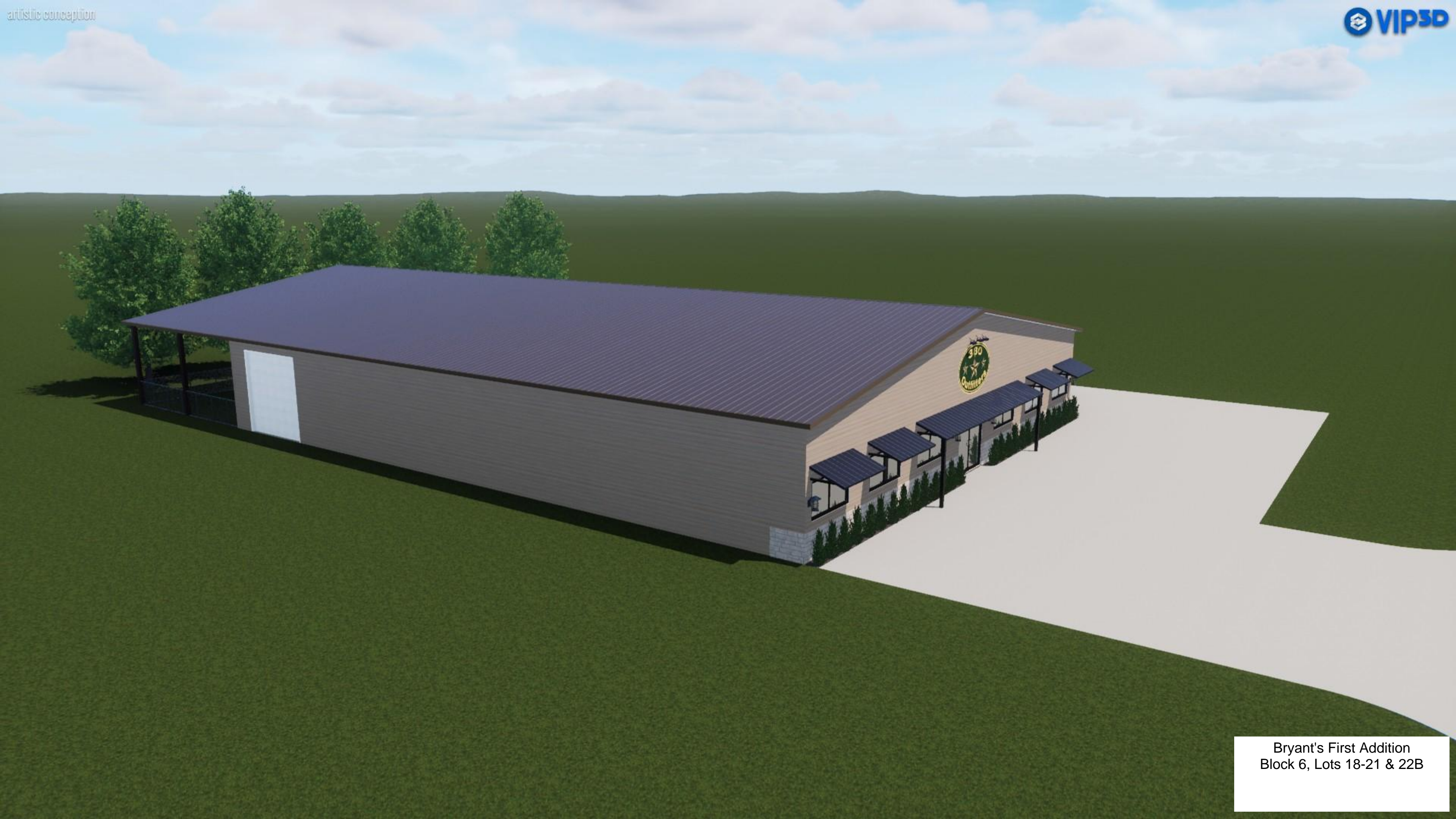
Bryant's First Addition Block 6, Lots 18-21 & 22B