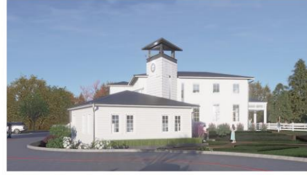
PERSPECTIVE SOUTH WEST VIEW - FROM STREET APPROACH