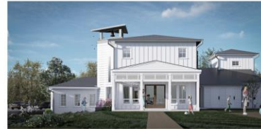
PERSPECTIVE EAST VIEW - FROM BARN

ROGERS HEALY ARCHITECTS 10000 Old Custer Rd., Suite 100 Prosper, TX 75078 972.488.8888 www.rogershealy.com