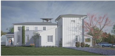
PERSPECTIVE NORTH VIEW - FROM SCHOOL