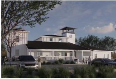
PERSPECTIVE ENTRY WEST VIEW - FROM PARKING • Height from entry grade to upper roof ridge 26'-9" • 2 Stories w/ Mezzanine