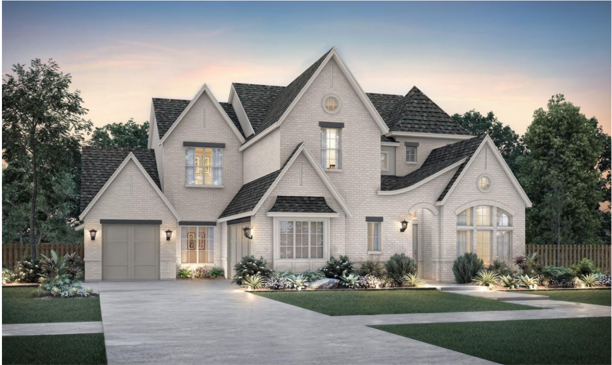
Exhibit F (Conceptual Elevations)