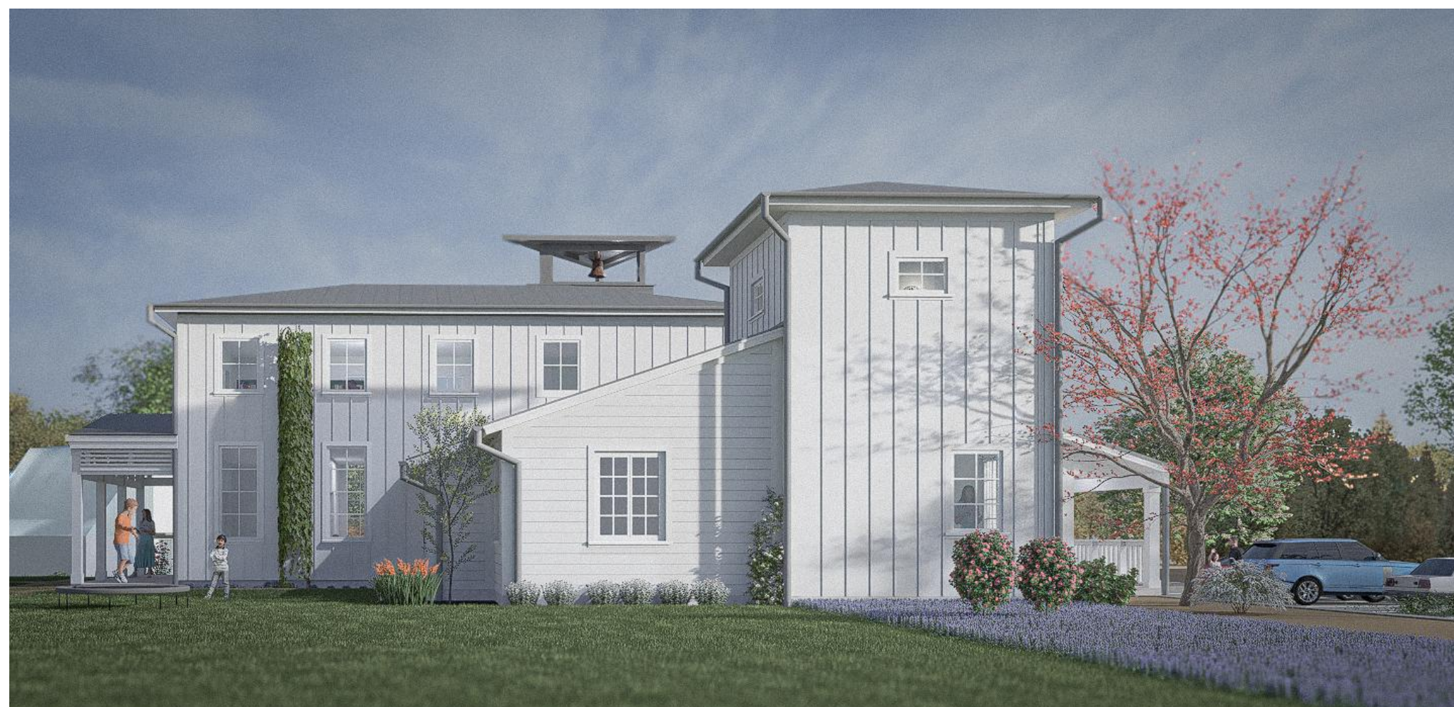
PERSPECTIVE NORTH VIEW - FROM REAR