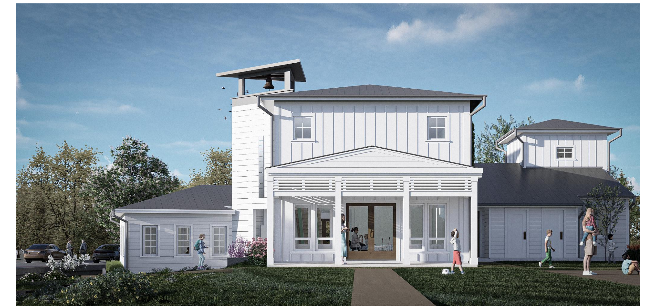
PERSPECTIVE WEST VIEW - FROM SIDE

ROGERS HEALY AND ASSOCIATES REAL ESTATE C: 214.418.0455 E: JP@RogersHealy.com W: RogersHealy.com A: 3001 Knox Street #210, Dallas, TX 75205 CLIENT: JP Findley