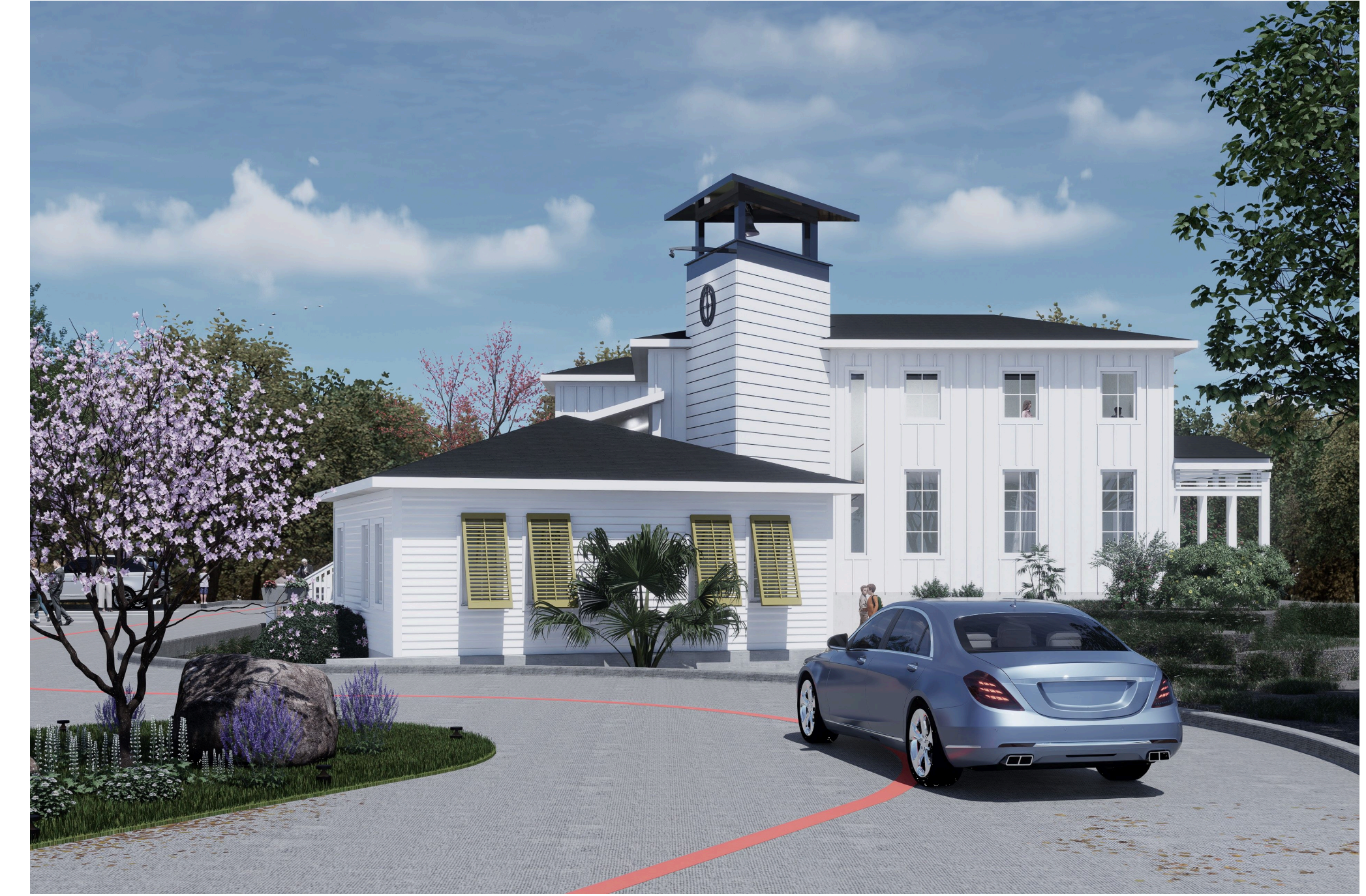
PERSPECTIVE EAST VIEW - FROM STREET APPROACH