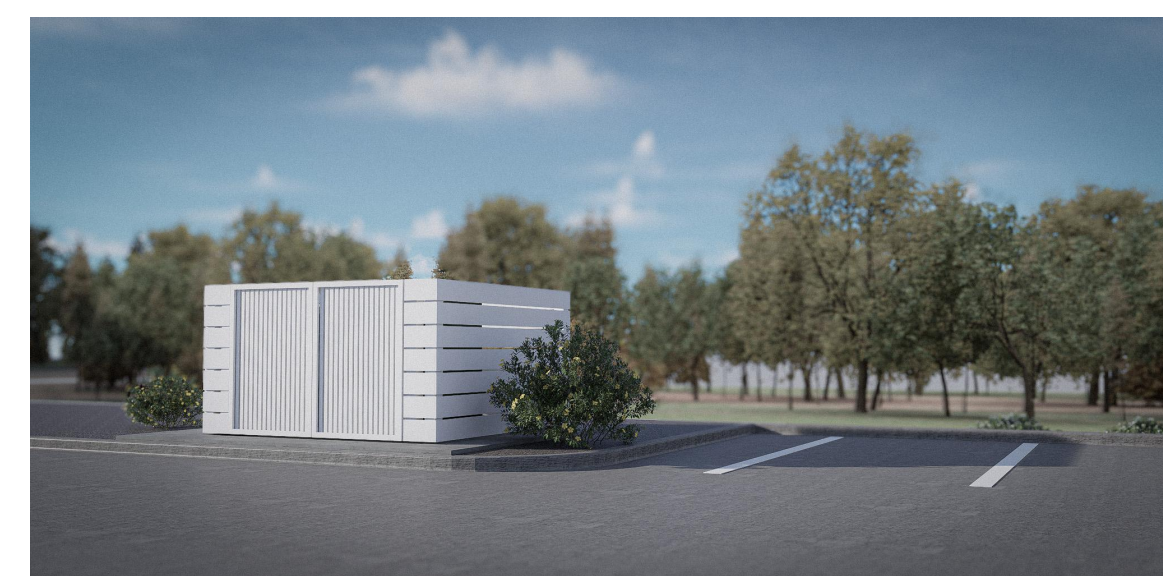
PERSPECTIVE DUMPSTER ENCLOSURE