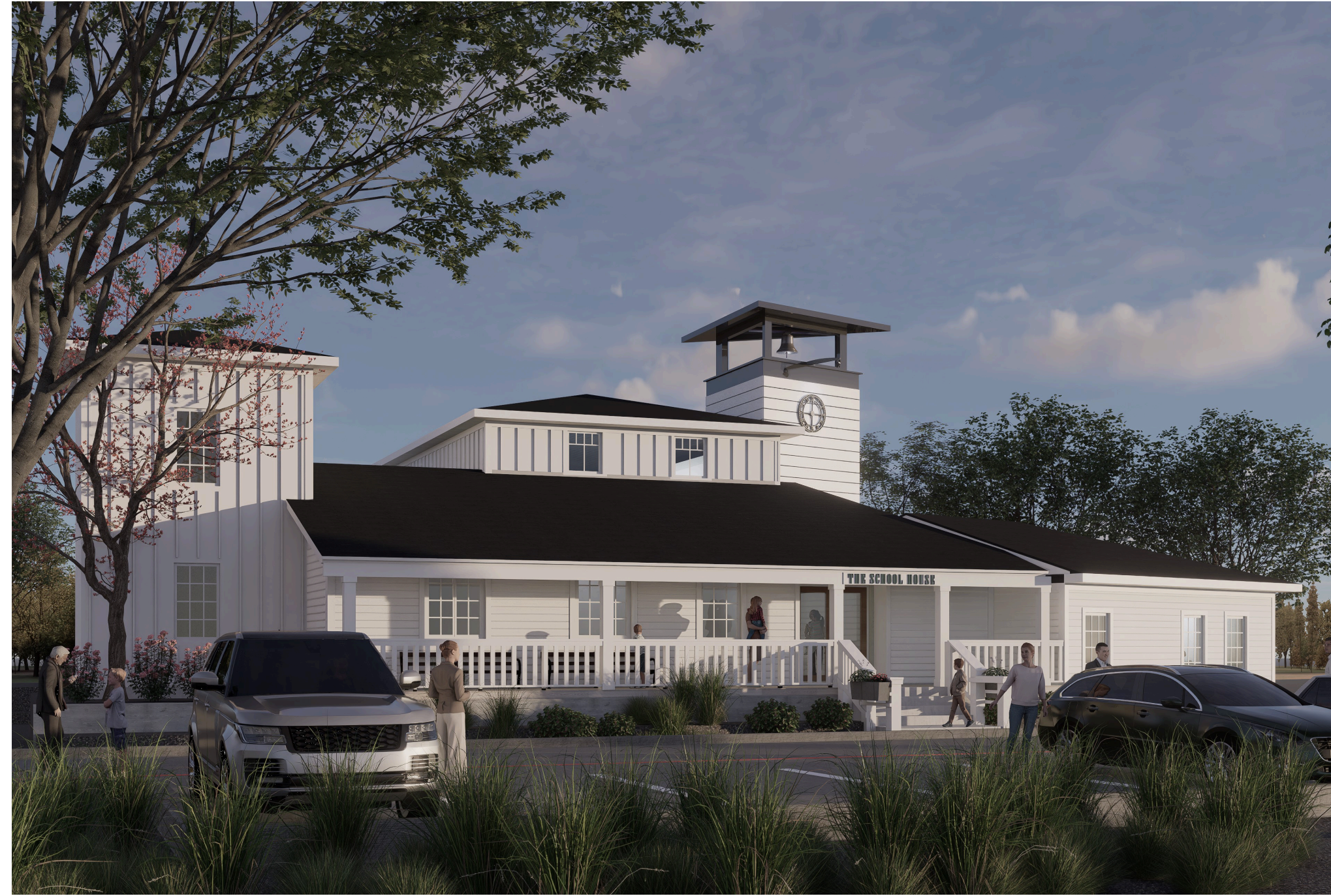
PERSPECTIVE ENTRY SOUTH VIEW - FROM PARKING