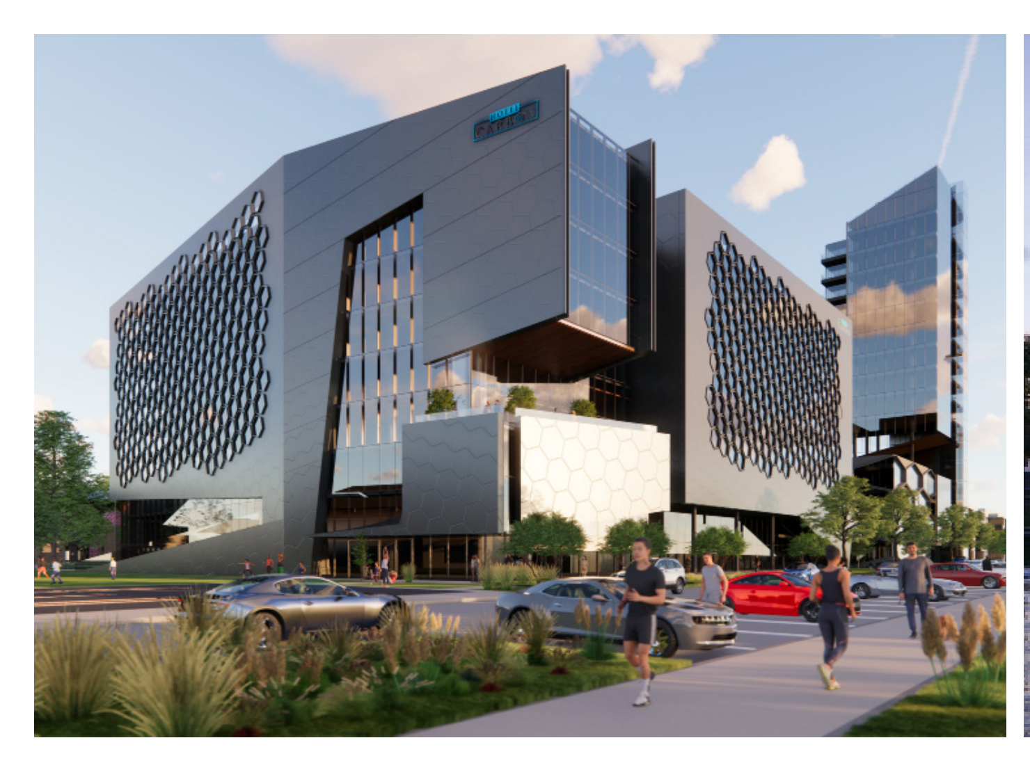
EXHIBIT F - CONCEPTUAL ELEVATIONS : HOTEL