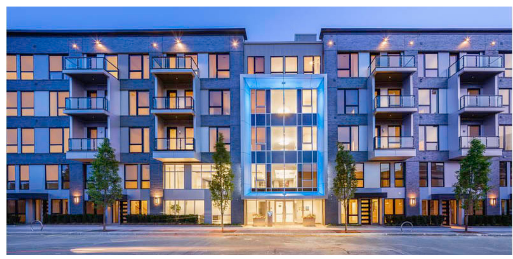
EXHIBIT F - CONCEPTUAL ELEVATIONS: MULTIFAMILY