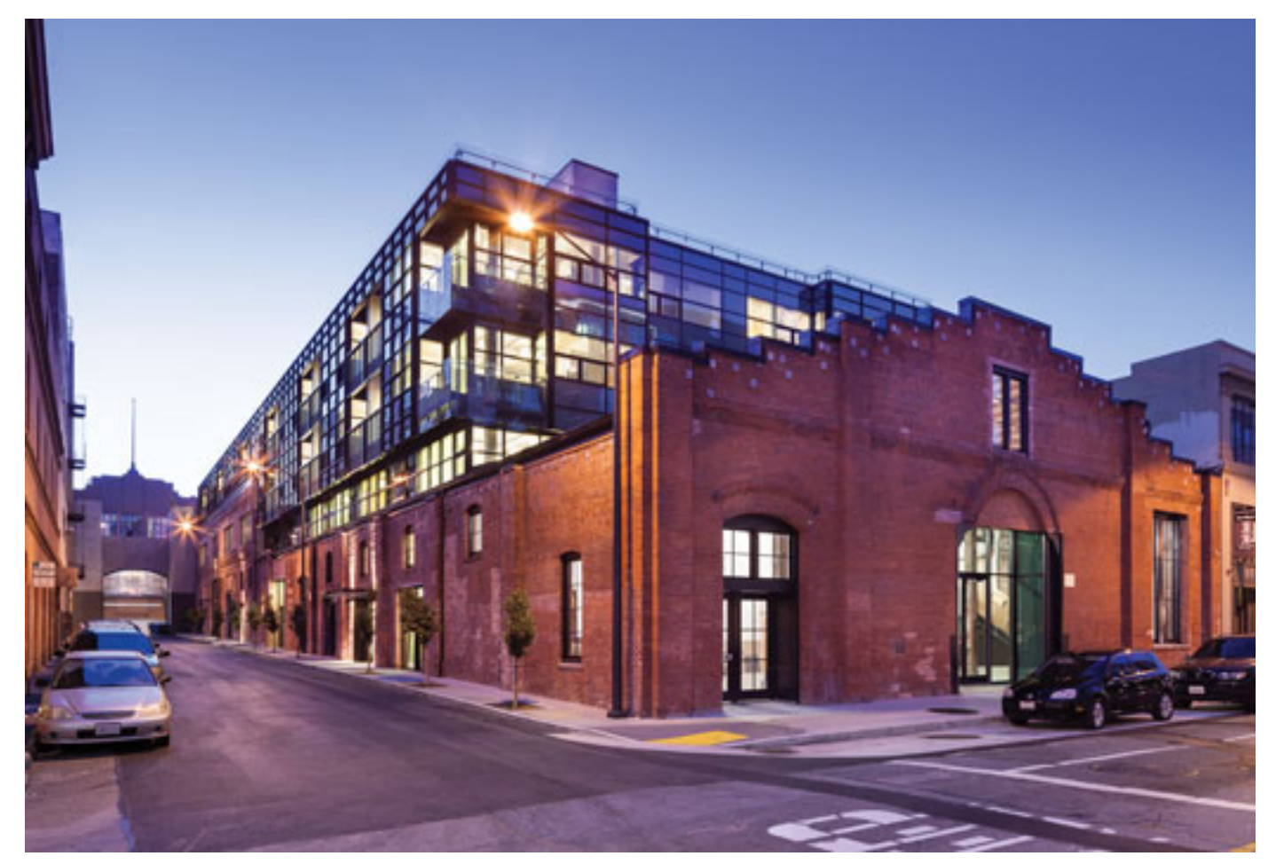
EXHIBIT F - CONCEPTUAL ELEVATIONS: RETAIL