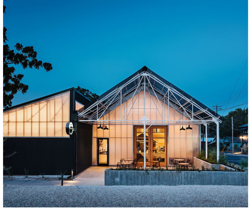
The imagery shown in this Exhibit F are intended to evoke a general look and feel for the architecture. Detailed material/style plans along with facade plans/elevations must be submitted at the time of Preliminary Site Plan and/or Site Plan approval.