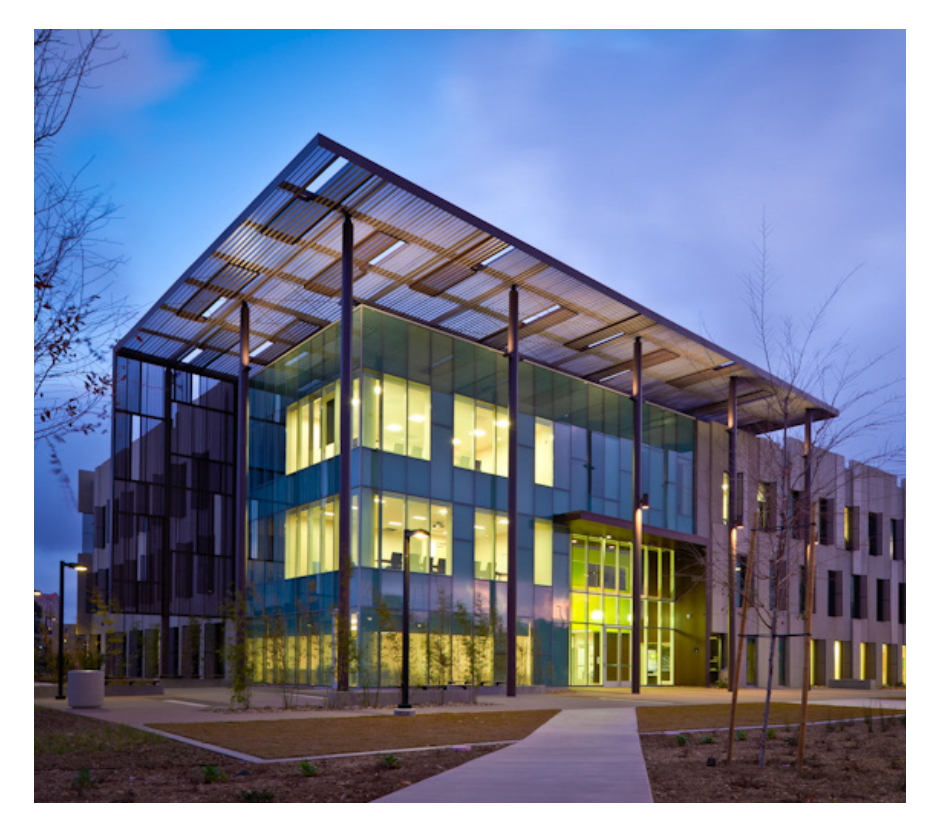
EXHIBIT F - CONCEPTUAL ELEVATIONS : OFFICE