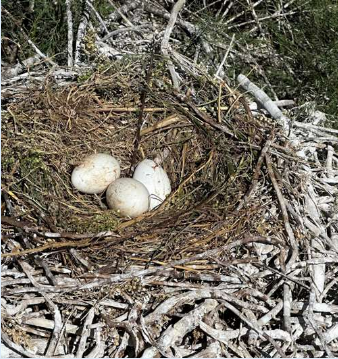
Pelican Nest with eggs.