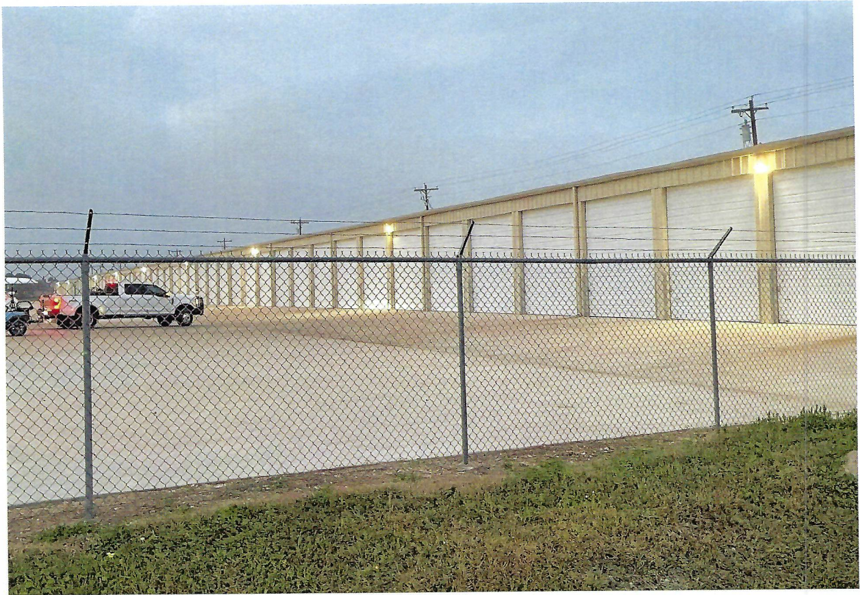
Boat Storage Lay-Out, 100% Fenced in.