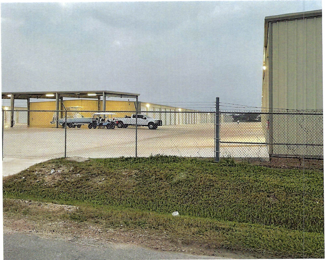
Boat and Trailer Wash Down Area.