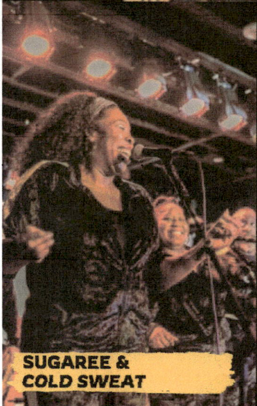
SUGAREE & COLD SWEAT