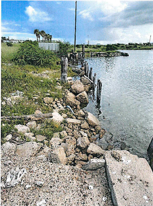
Tract 10 – looking northeast from the south point