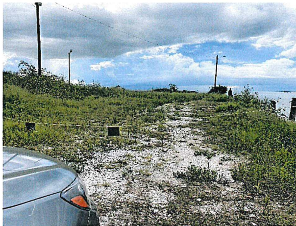
Tract 10 – Looking southeast at approx. the 330 ft mark – the area beyond this point is not being leased (approx. 146 linear feet of dock)

Below are some photos taken of the south end of Tract 10 on September 16. Jim is going to get with Prestige to have them get their leased area mowed.