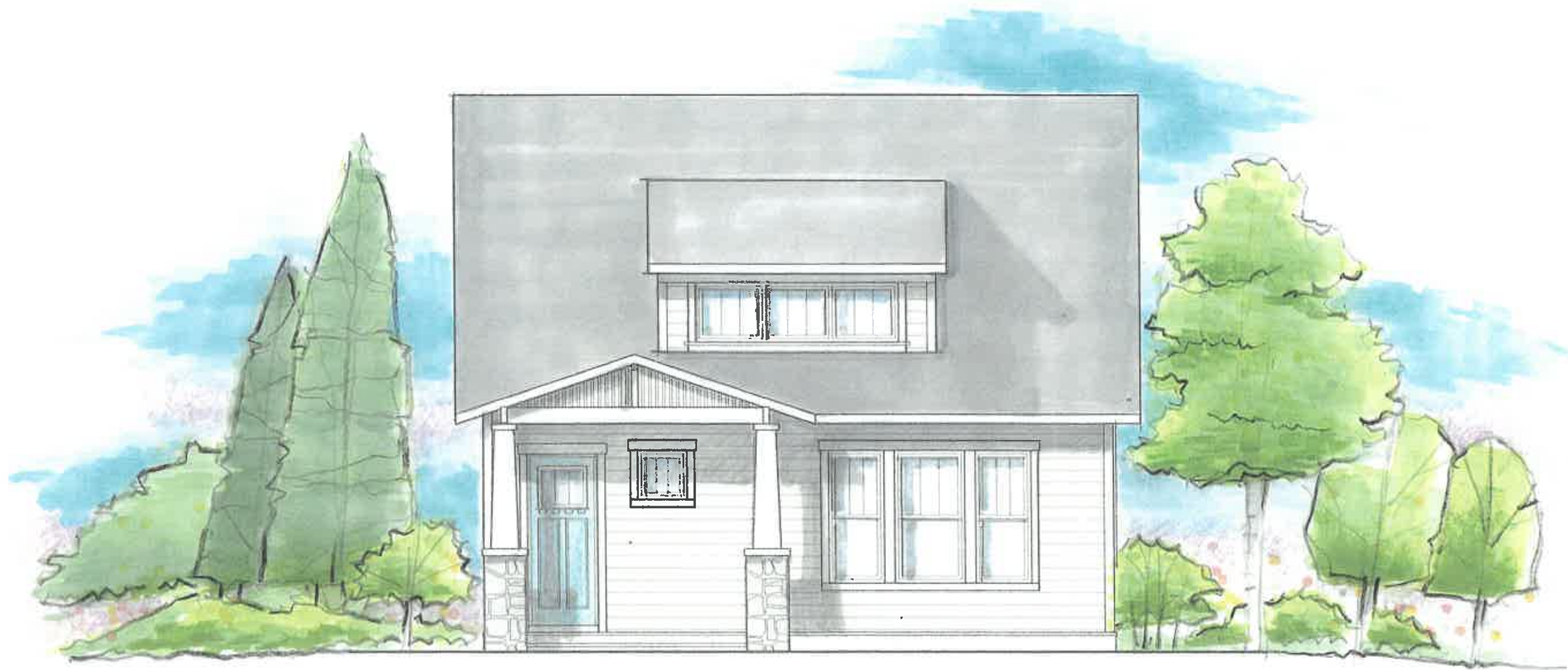
REPRESENTATIVE ELEVATION SINGLE FAMILY DETACHED HOME FOR USE ON 41' AND 48' WIDE LOTS