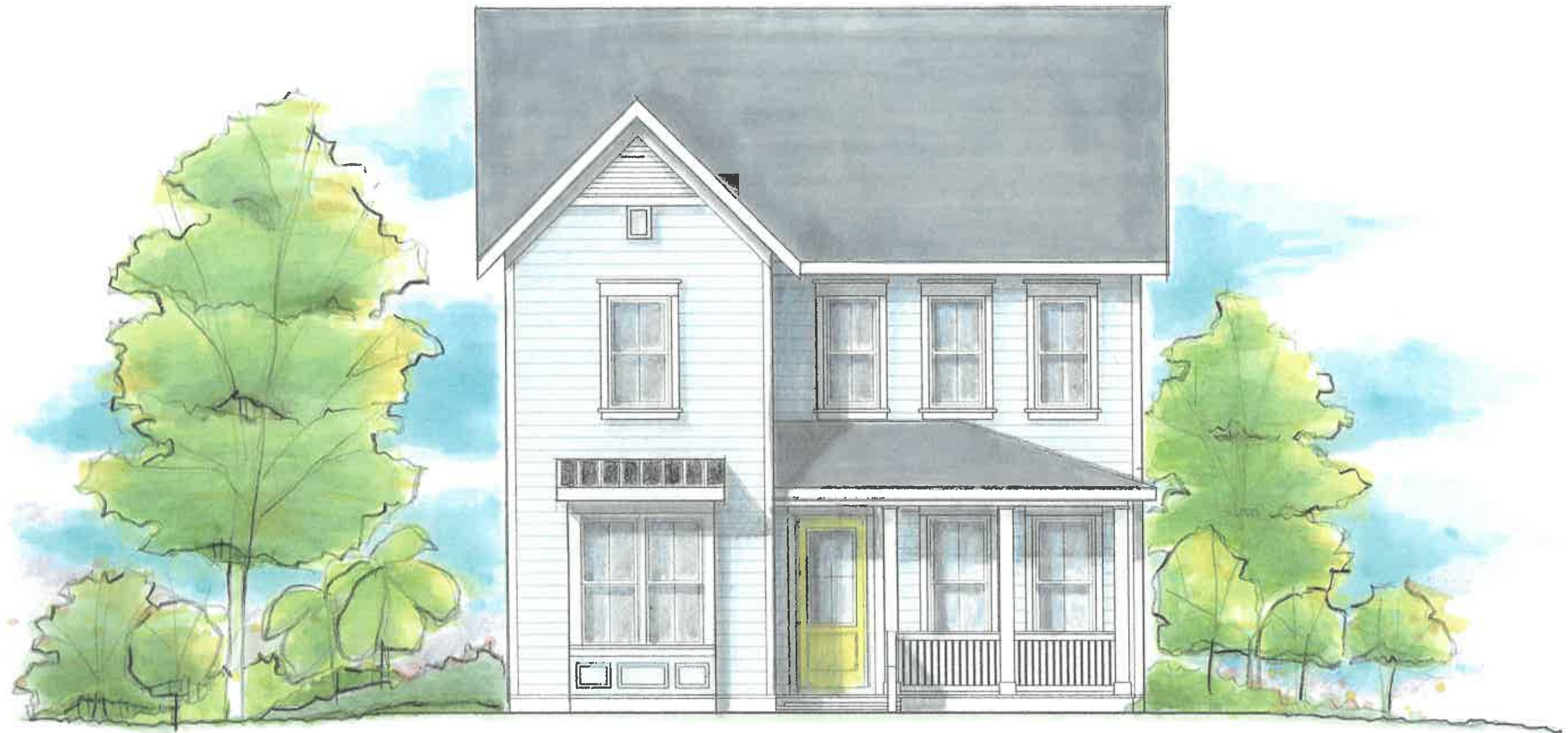
REPRESENTATIVE ELEVATION SINGLE FAMILY DETACHED HOME FOR USE ON 41' AND 48' WIDE LOTS