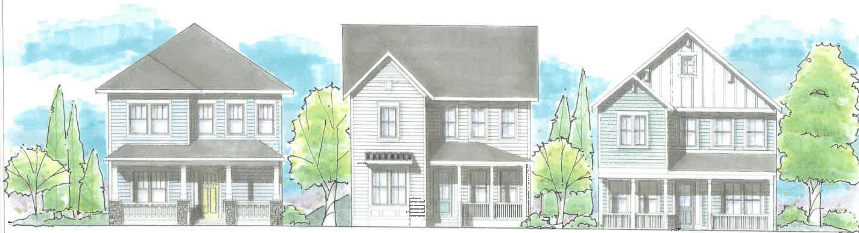
REPRESENTATIVE STREET VIEW SINGLE FAMILY ALLEY LOAD DETACHED HOMES FOR USE ON 41' LOTS

FILE: TH ELEVATIONS 3-30-21.dwg DATE: 3/30/2021 3:33 PM