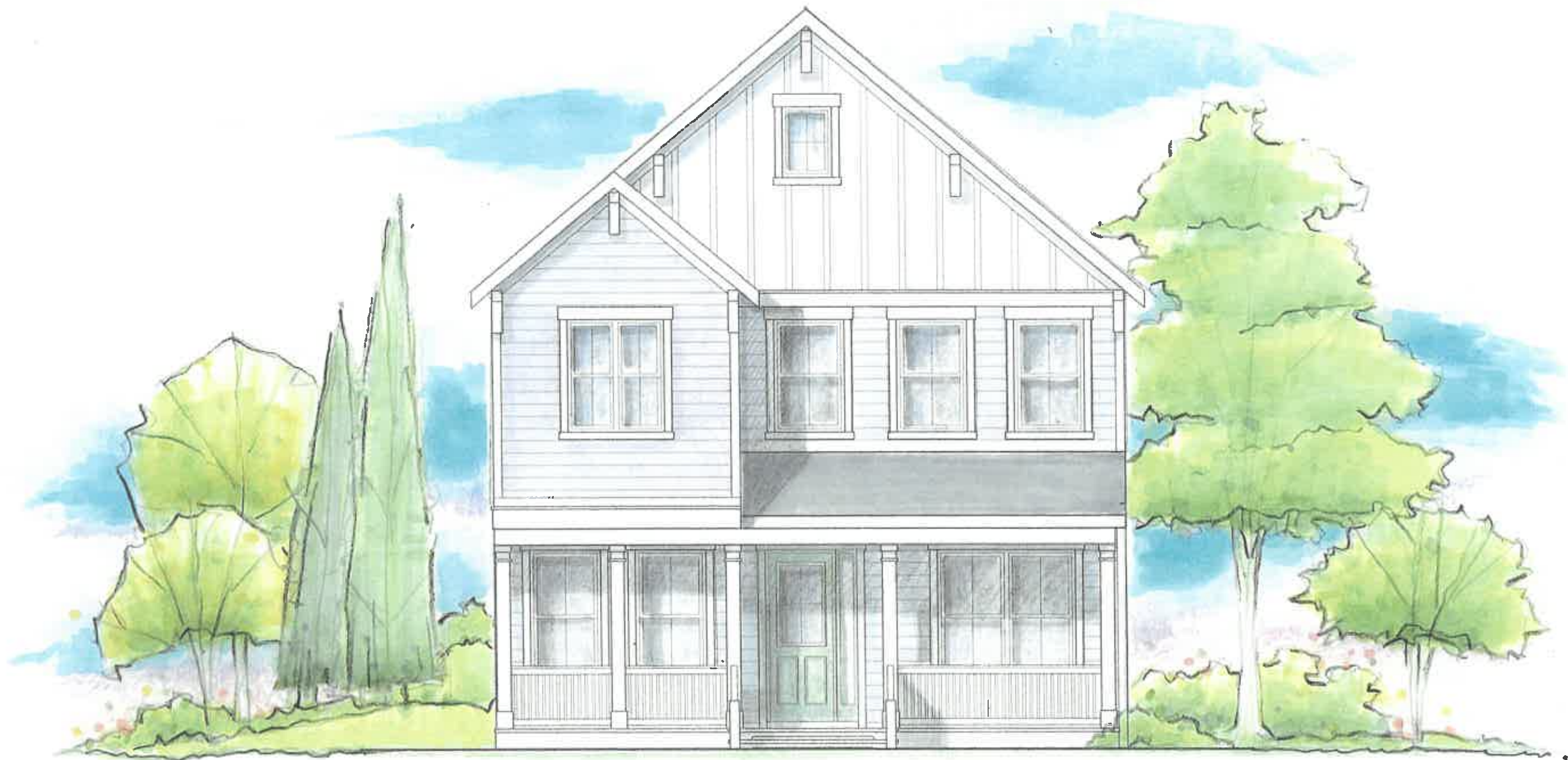
REPRESENTATIVE ELEVATION SINGLE FAMILY DETACHED HOME FOR USE ON 41' AND 48' WIDE LOTS