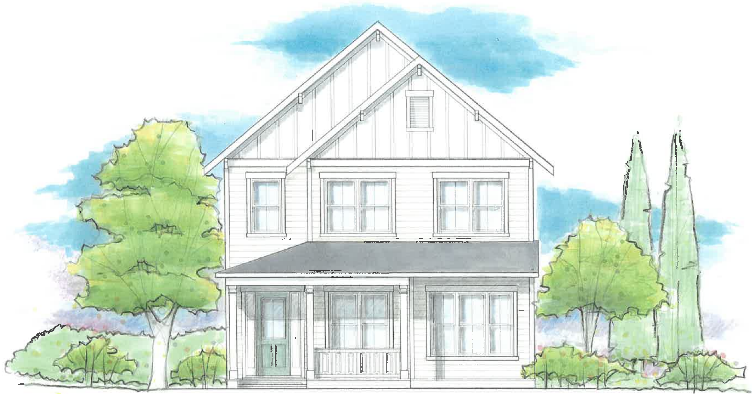
REPRESENTATIVE ELEVATION SINGLE FAMILY DETACHED HOME FOR USE ON 41' AND 48' WIDE LOTS