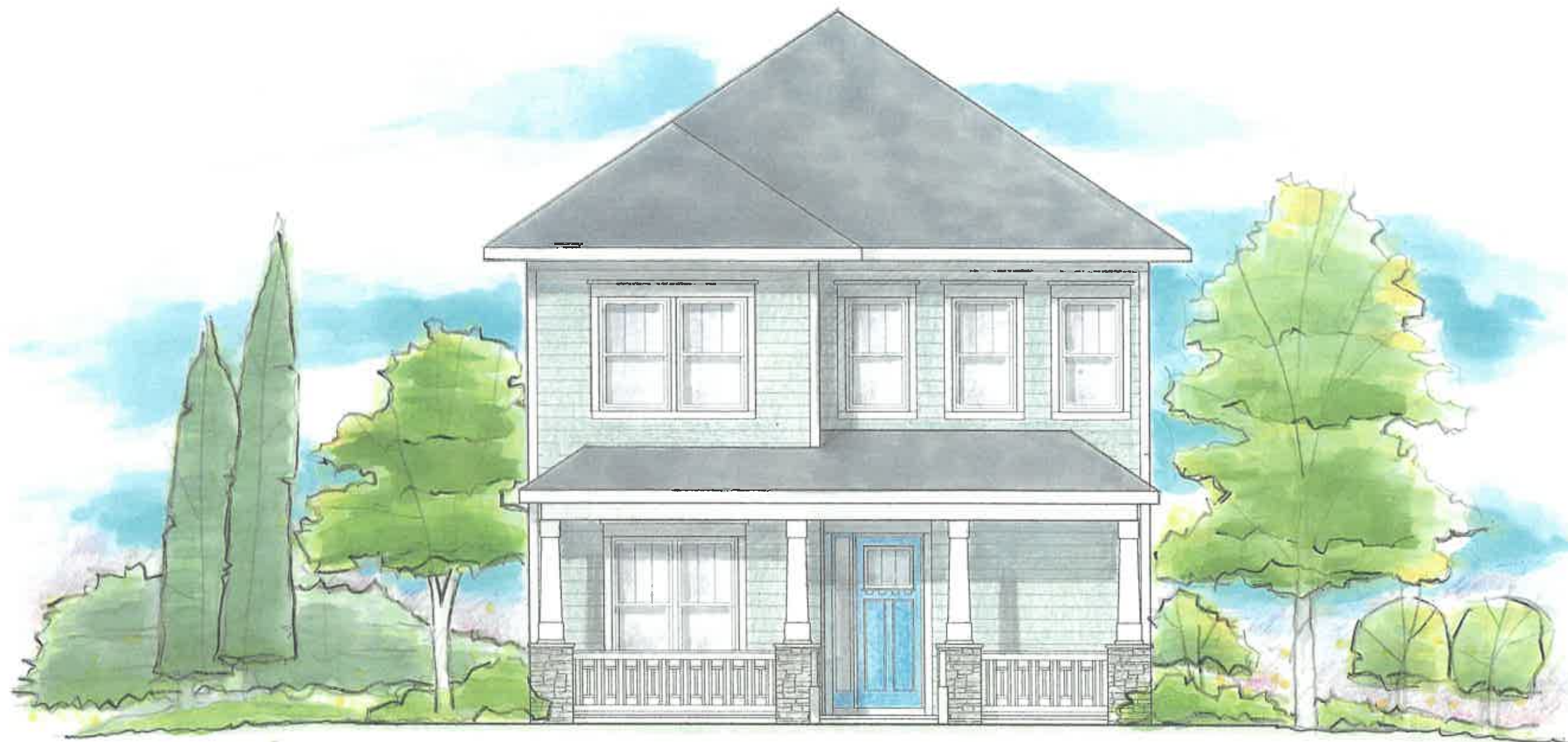
REPRESENTATIVE ELEVATION SINGLE FAMILY DETACHED HOME FOR USE ON 41' AND 48' WIDE LOTS