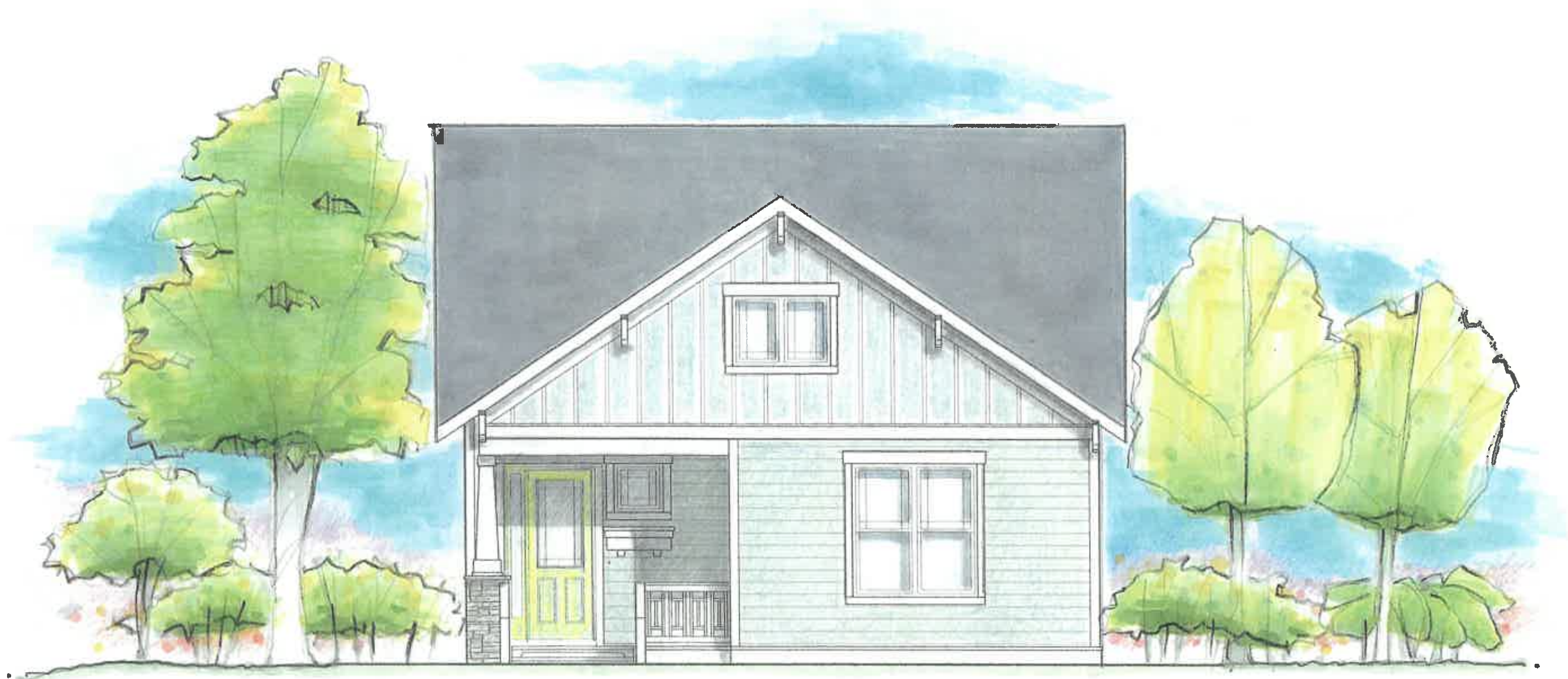
REPRESENTATIVE ELEVATION SINGLE FAMILY DETACHED HOME FOR USE ON 41' AND 48' WIDE LOTS