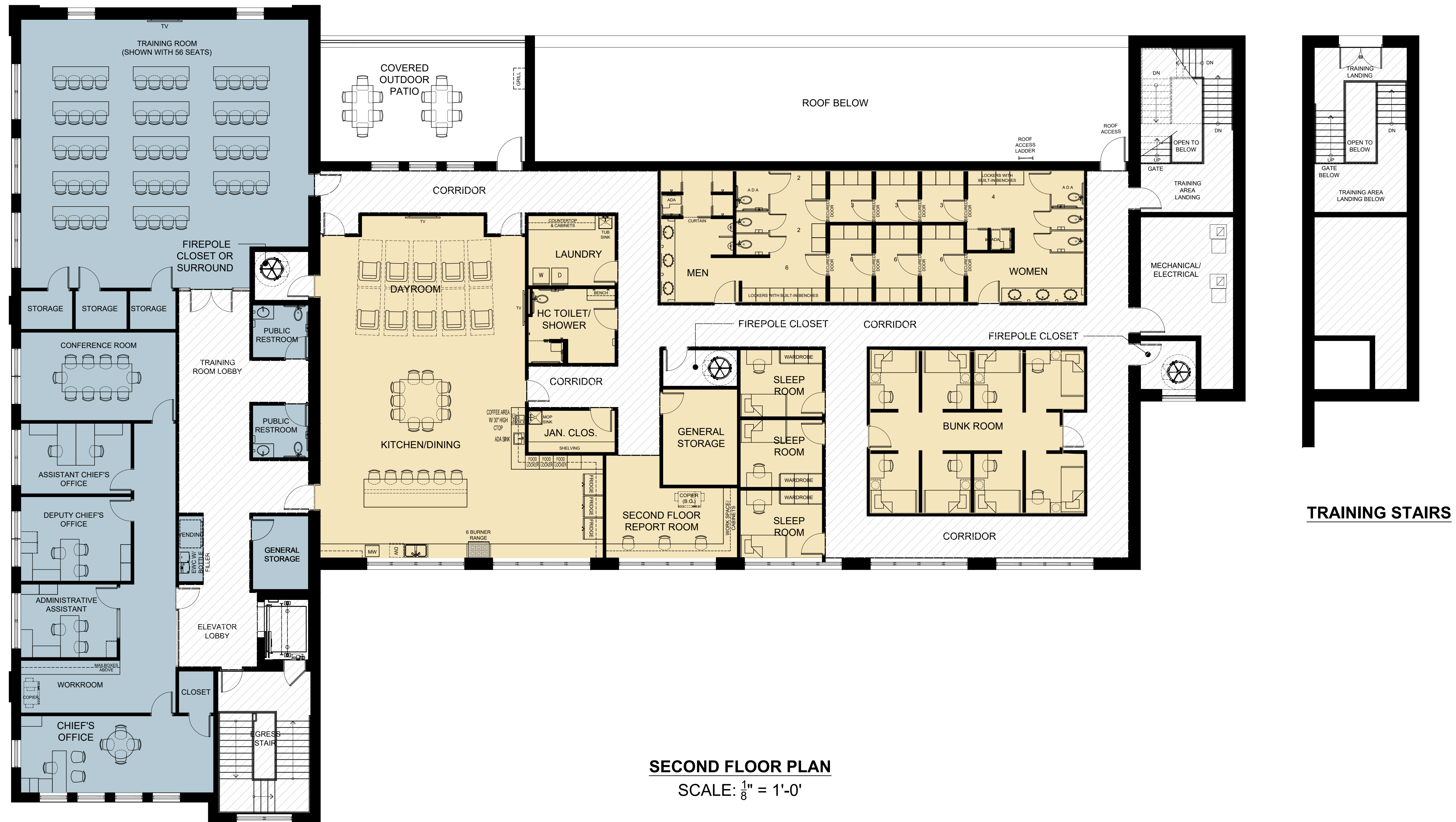
SECOND FLOOR PLAN SCALE: 1/8" = 1'-0"