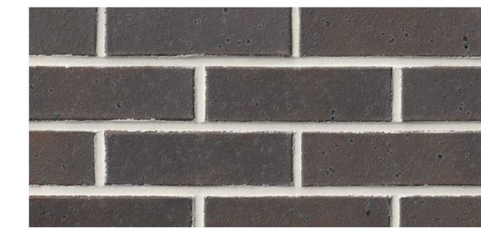
BRICK COLOR 2