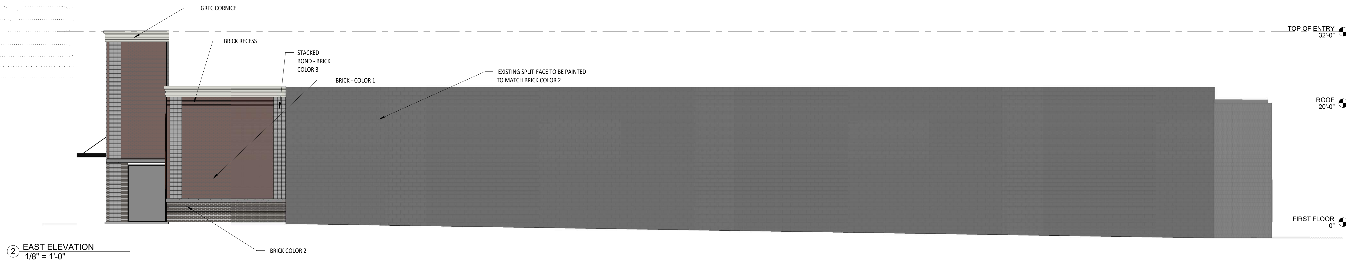
2 EAST ELEVATION 1/8" = 1'-0"