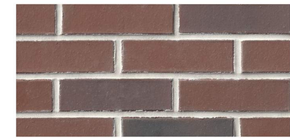
BRICK COLOR 1