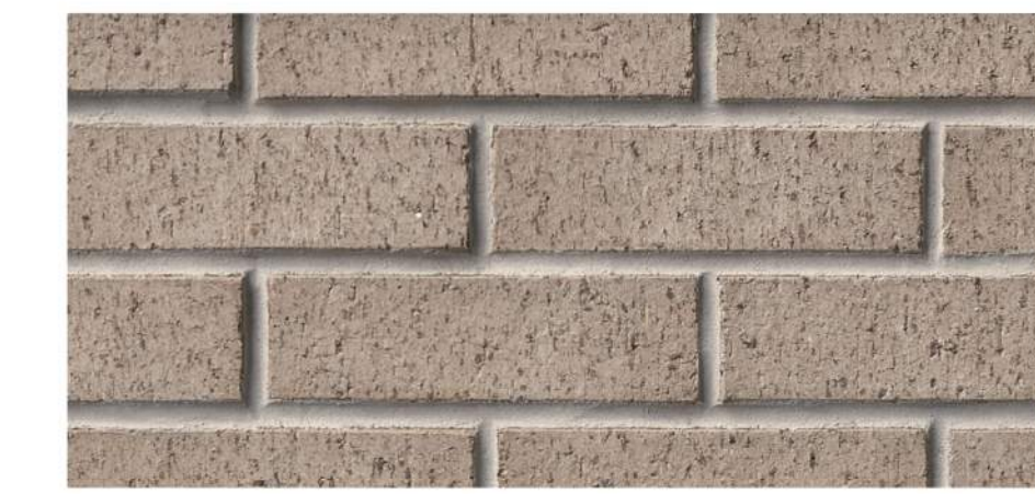
BRICK COLOR 3