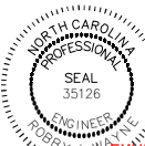
EXHIBIT MAP DO NOT USE FOR CONSTRUCTION 04-12-2023