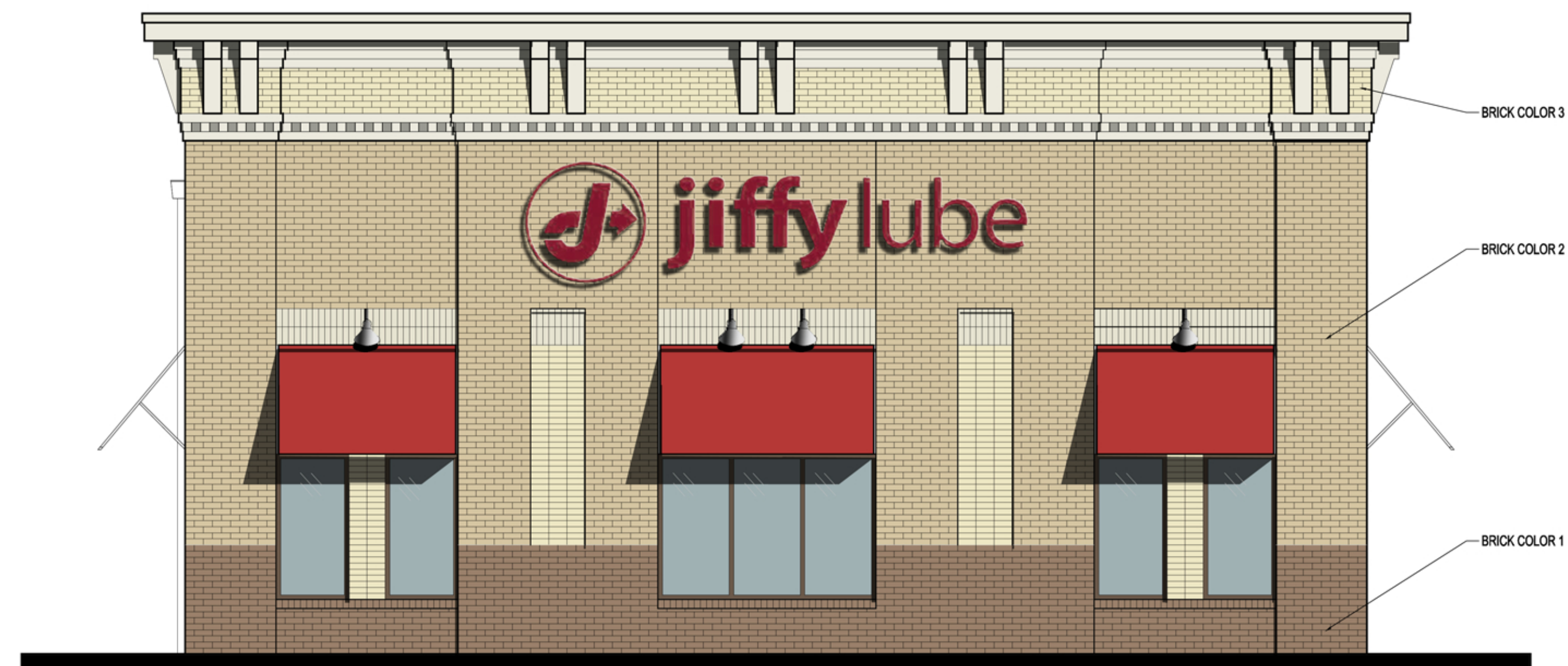
POLK STREET ELEVATION