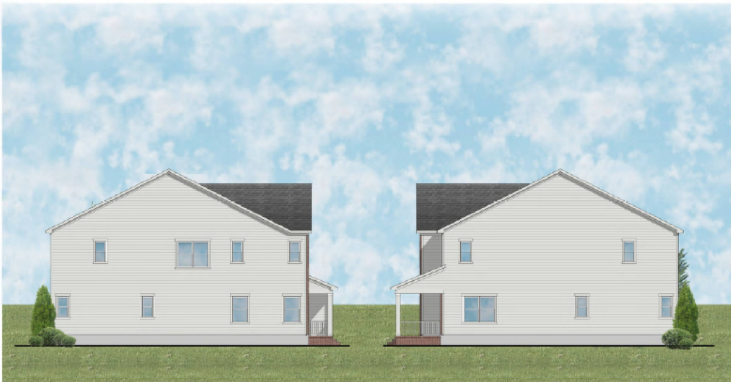
5-Plex Left Elevation