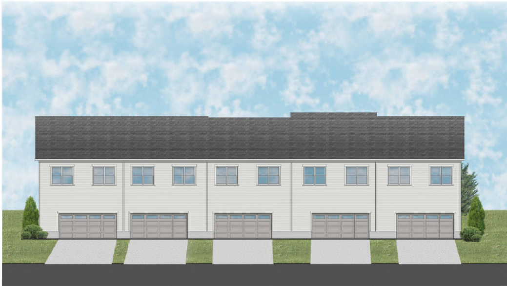
5-Plex Rear Elevation