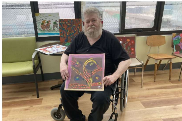
Aiden Luhr / Petersburg Pilot