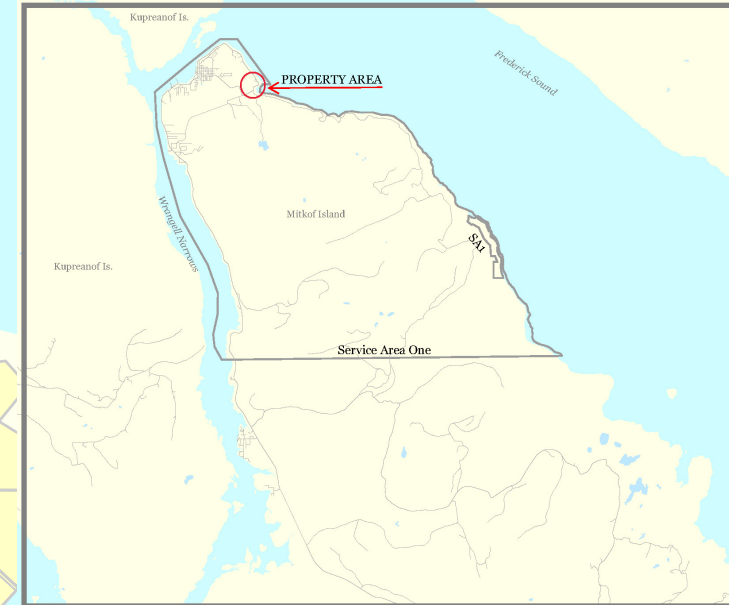
B. Vicinity & Detail Map