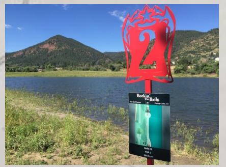
Rockin' the Rails Disc