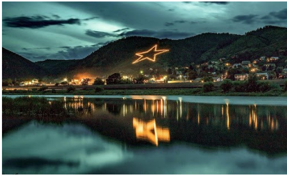
Palmer Lake Star