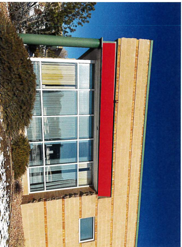
■ Sign placement area (covering existing signage)