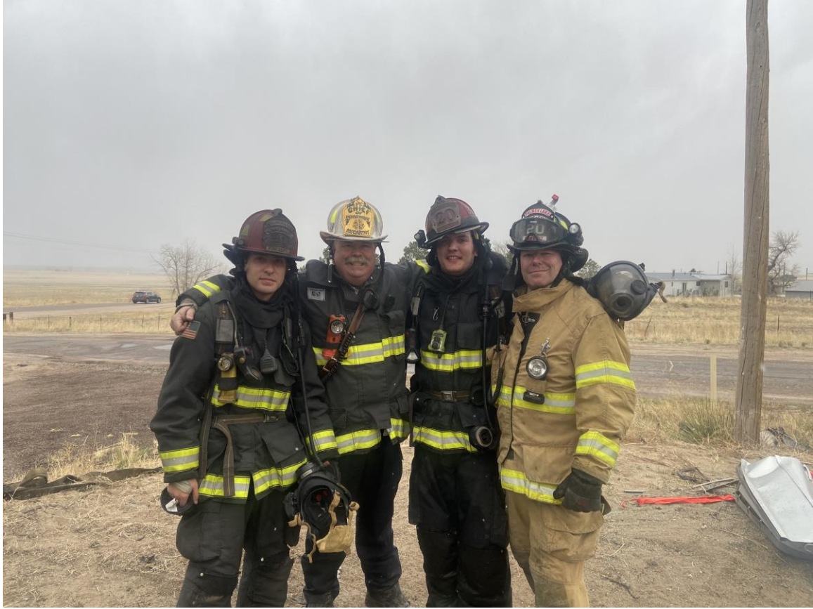
Figure 2 Proctor Cadre