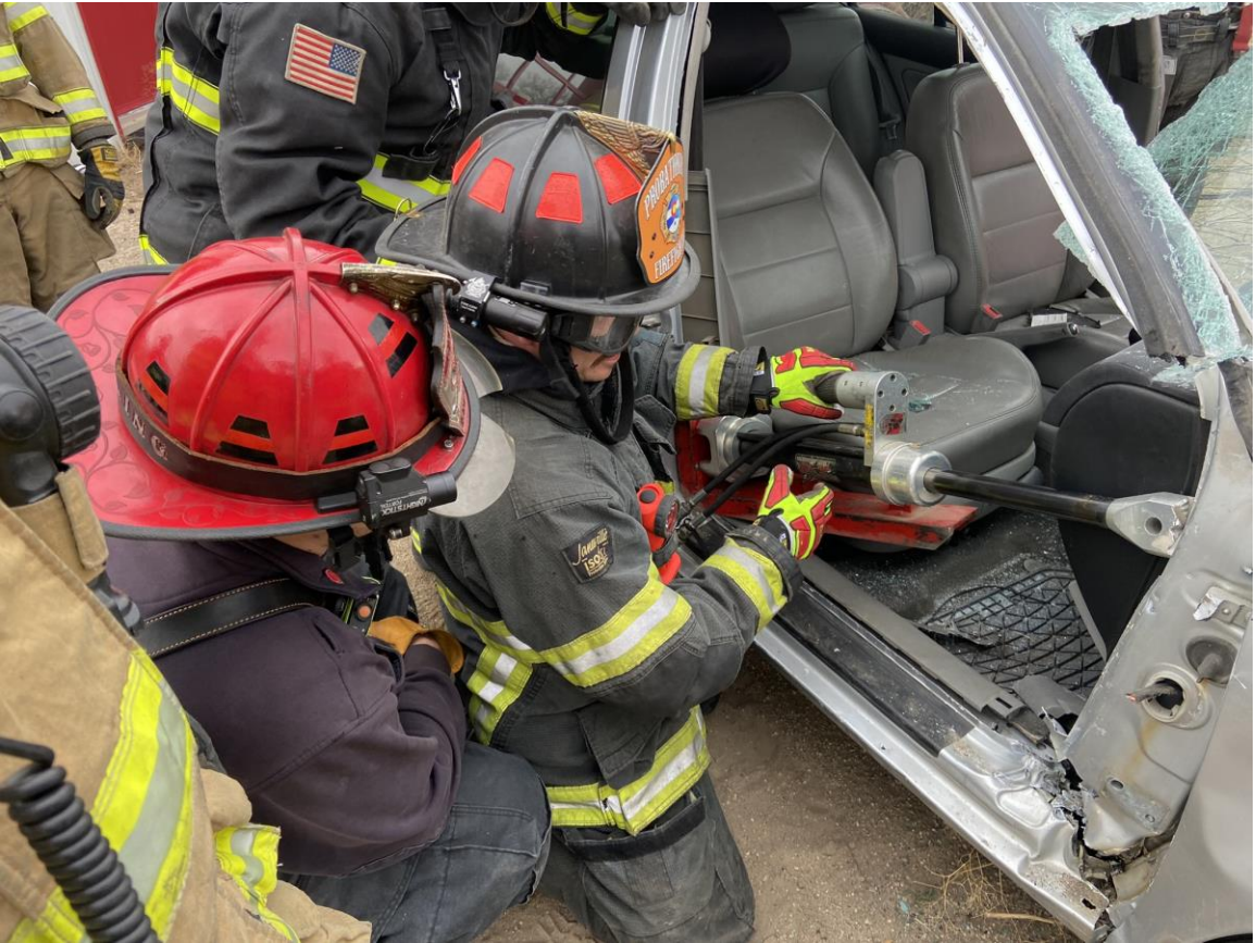
Figure 4 Displacing the Dash