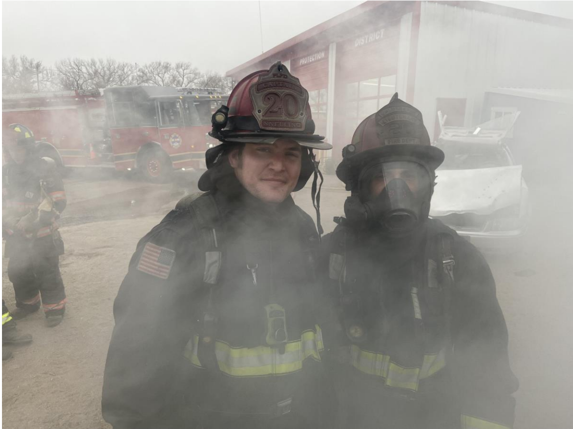
Figure 3 Successful completion of JPRs