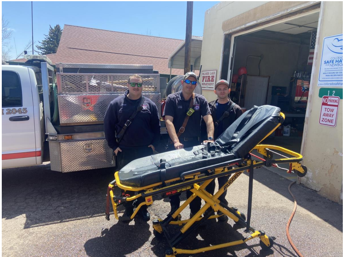
Figure 1 A-Shift with our new(sed) stretcher