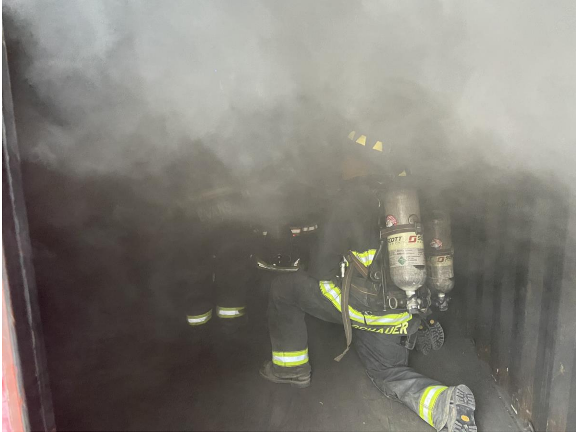
Figure 5 Making Entry