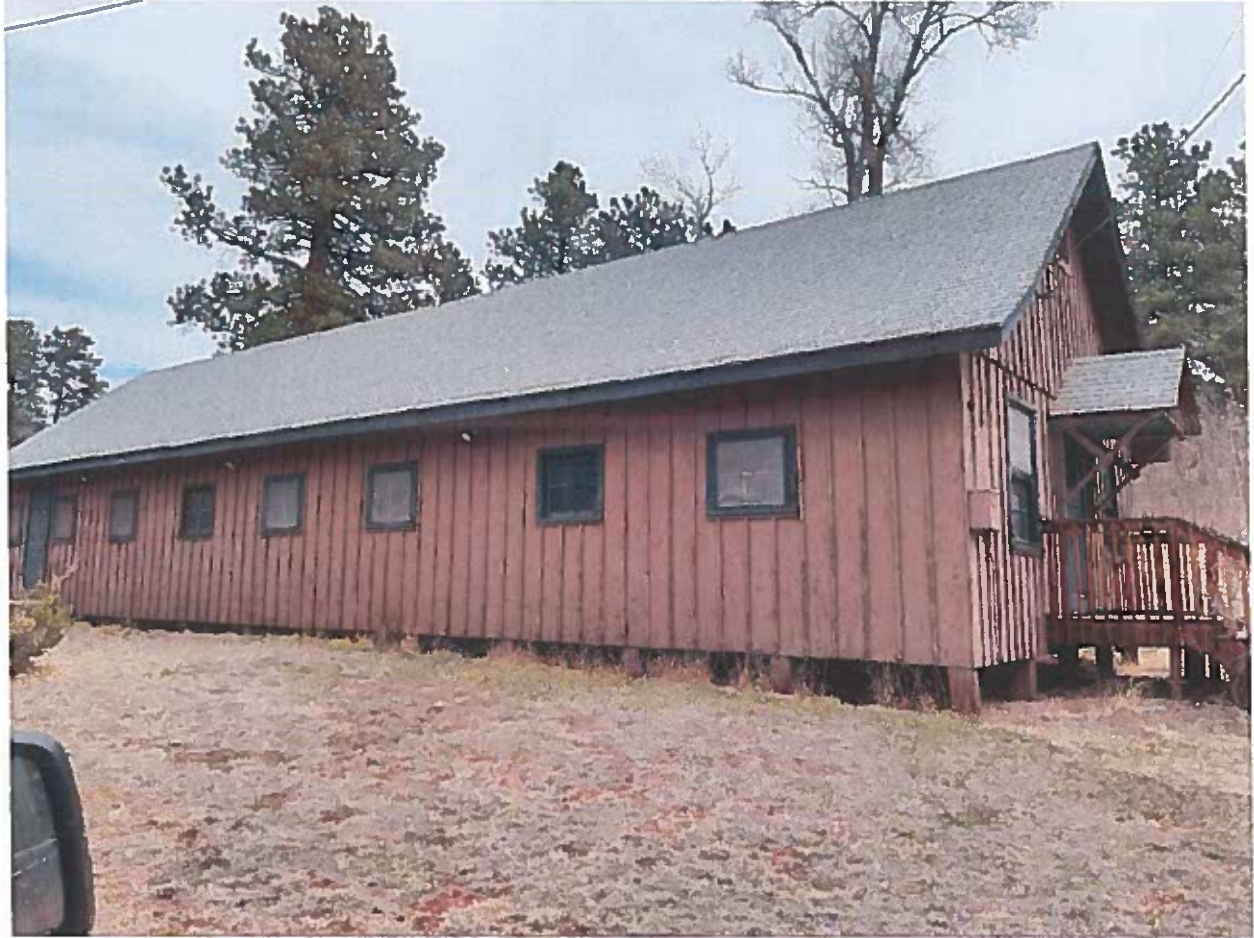
The chapel is in fair shape and should be secured from future damage.