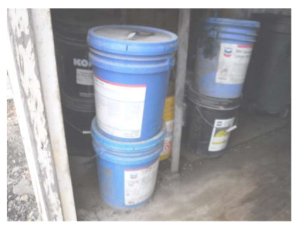
Photo 4-C: Petroleum Products inside Maintenance Supply Shed on Subject Property.