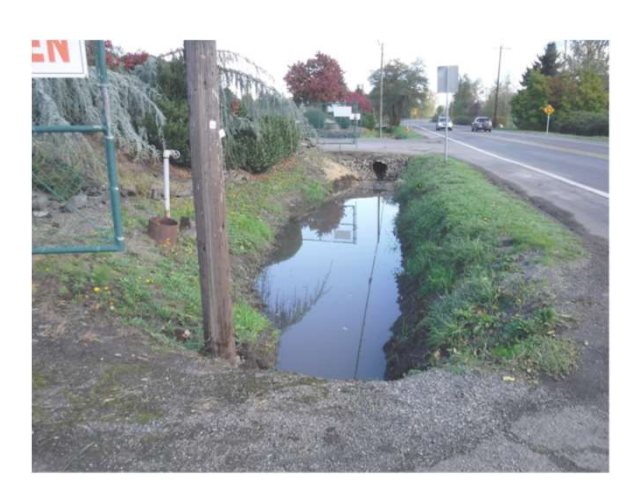
Photo 5-D: Stormwater Ditch Along Washington St on Subject Property.