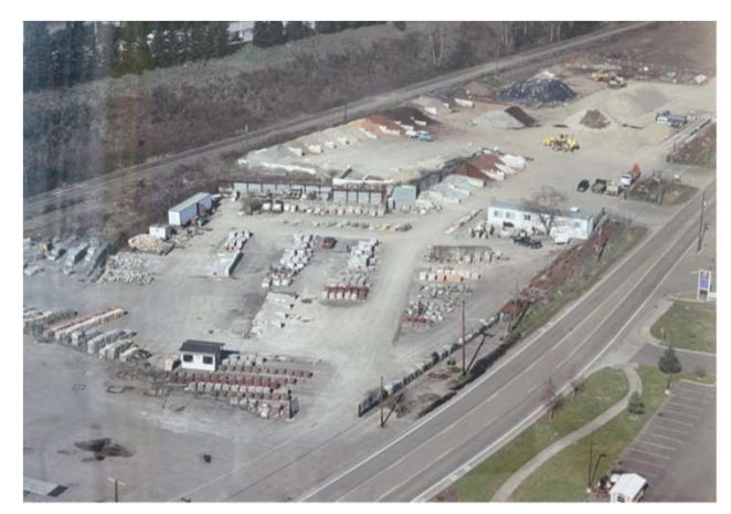
Photo 2-A: Aerial View of Ramp on the Subject Property Provided by Occupant.