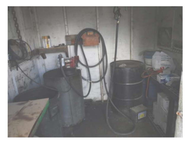
Photo 4-D: Petroleum Products inside Maintenance Supply Shed on Subject Property.