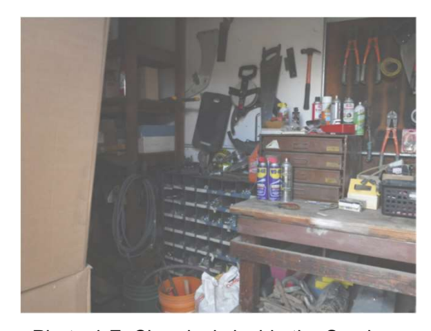
Photo 4-F: Chemicals inside the Semi-Trailer on Wheels Used as a General Mechanical Work Shop.