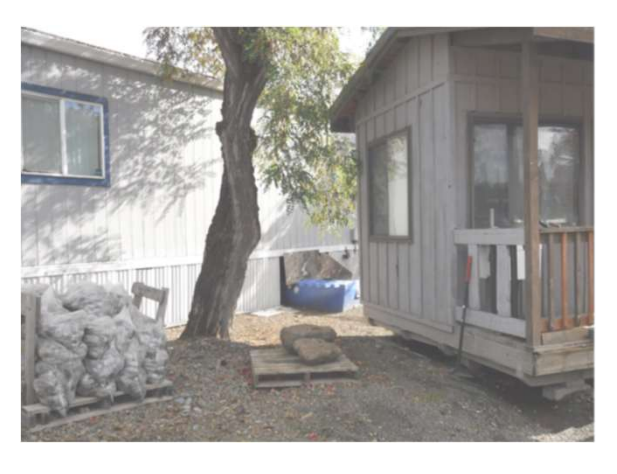
Photo 3-C: Mobile Trailer Type Building and Display Shed on Subject Property.