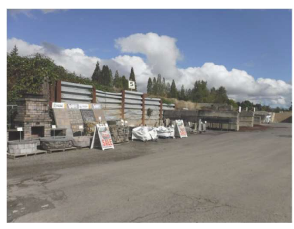
Photo 2-B: View of Southeast Side of Ramp with Steel Retaining Walls.