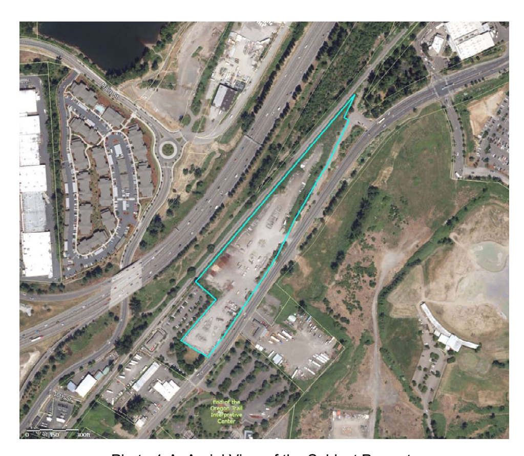
Photo 1-A: Aerial View of the Subject Property Used as Base Map for Site Reconnaissance..