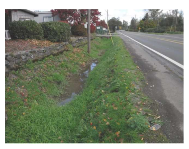
Photo 5-B: Stormwater Ditch Along Washington St on Subject Property.