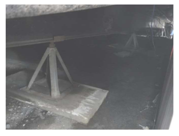
Photo 3-F: Below Mobile Trailer Type Building on Subject Property.