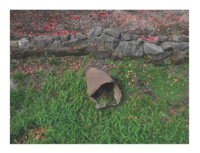
Photo 5-C: Outfall into Ditch Along Washington St on Subject Property.