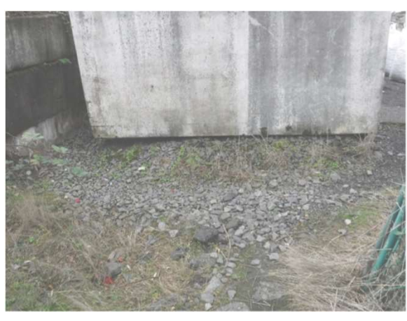
Photo 4-B: Enclosed Base of Maintenance Supply Shed on Subject Property.