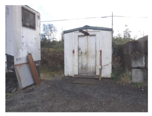
Photo 2-E: Small Maintenance Supply Shed (Petroleum Products Storage).