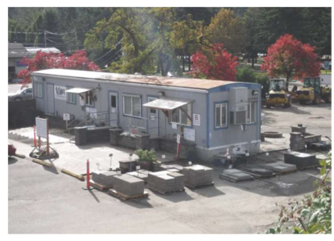
Photo 2-D: Mobile Trailer Type Building Used as an Office on the Subject Property.