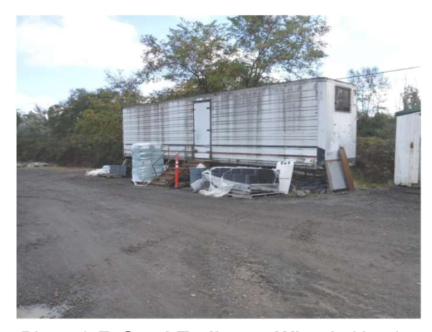
Photo 2-F: <u>Semi-Trailer on Wheels</u> Used as a General Mechanics Shop and Storage.