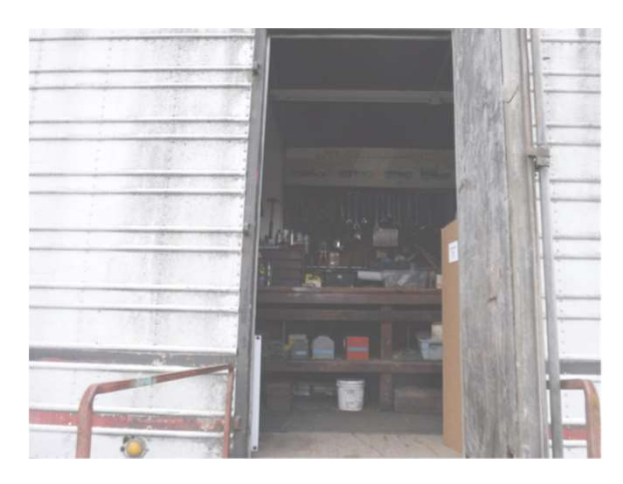
Photo 4-E: Semi-Trailer on Wheels Used as a General Mechanical Work Shop.