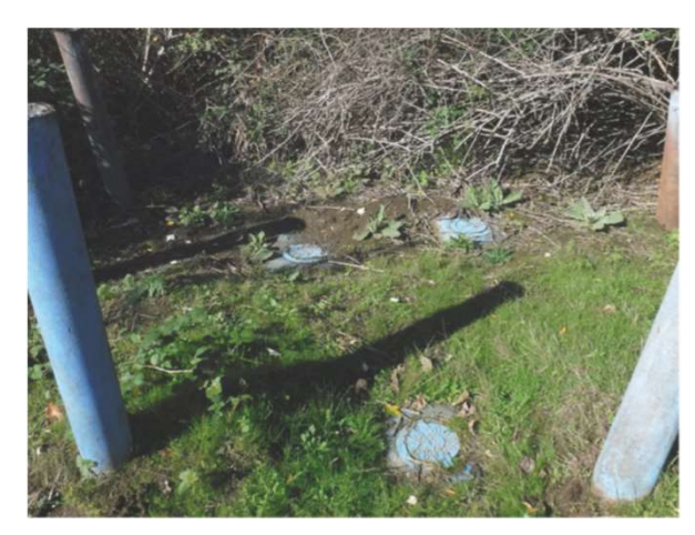
Photo 5-E: Flush Mount Monument for Soil Gas Samples Monitoring Wells Along Gravel Access Road Right-of Way.