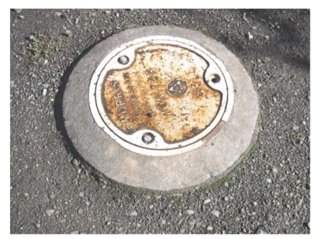
Photo 5-F: Flush Mount Monument for Groundwater Samples Monitoring Well Along Gravel Access Road Right-of Way.