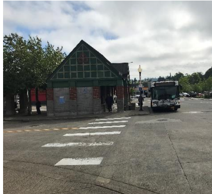
CAT Bus stop