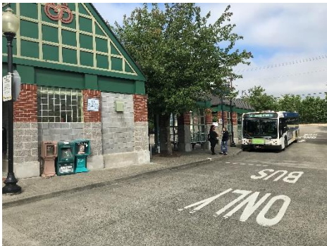
TriMet Bus Stop and Shelter