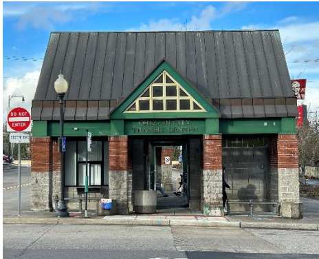
Existing Bus Driver Restroom