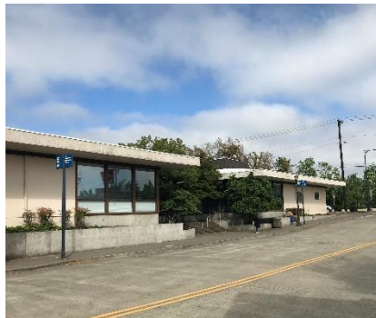
TriMet Bus Stops