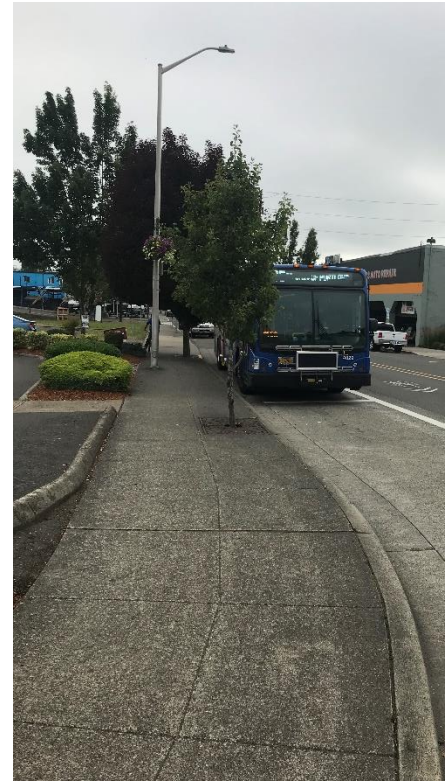
TriMet Bus Parking