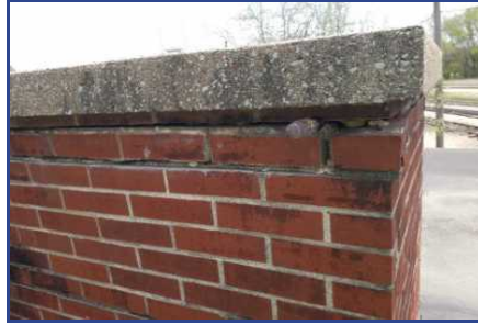
Section B - Deficiency #1 Chimney is falling apart causing leakage