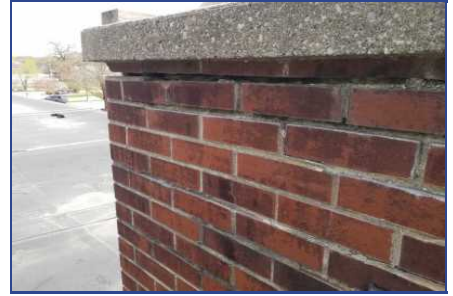
Section B - Deficiency #1 Chimney is falling apart causing leakage