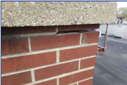
Section B - Deficiency #1 Chimney is falling apart causing leakage