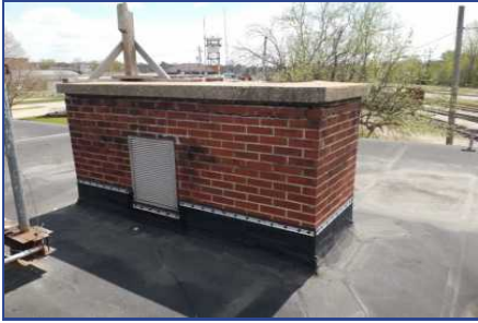
Section B - Deficiency #1 Chimney is falling apart causing leakage