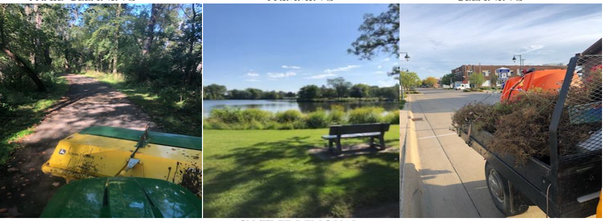
ASH TREE REMOVAL