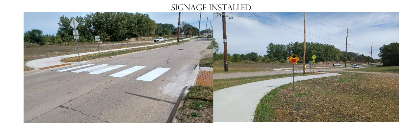
SEGMENT THREE TRAIL