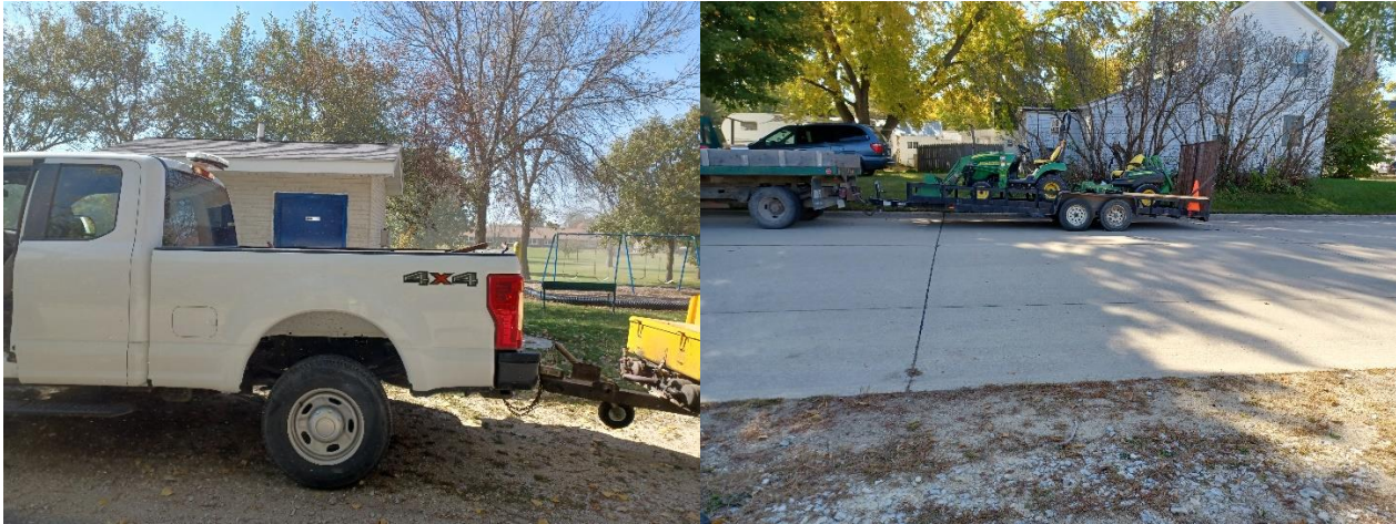
PLATT PARK ASH TREE REMOVAL