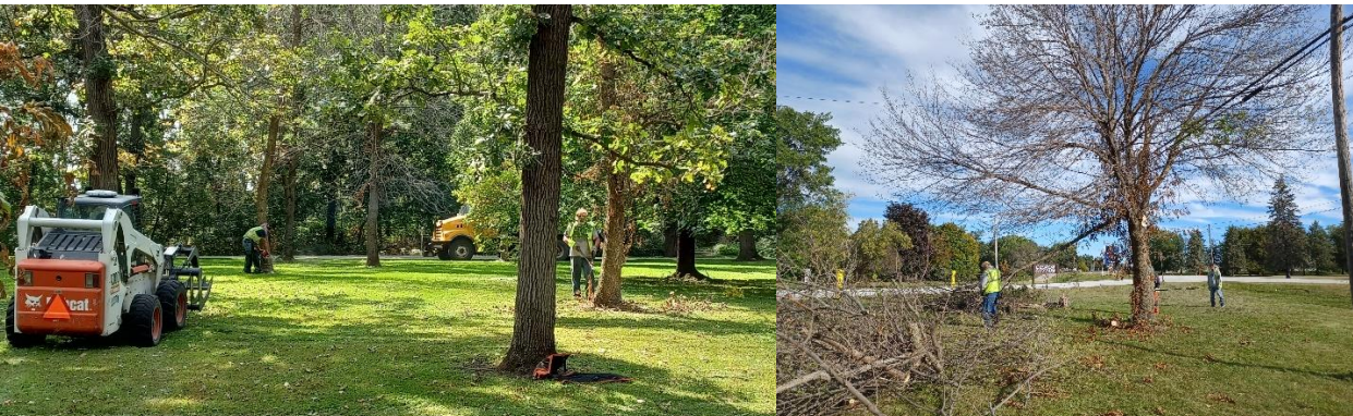
ASH TREE REMOVAL