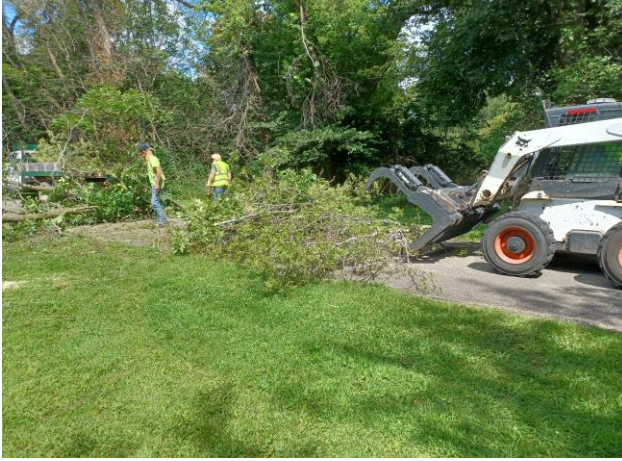
ASH TREE REMOVAL