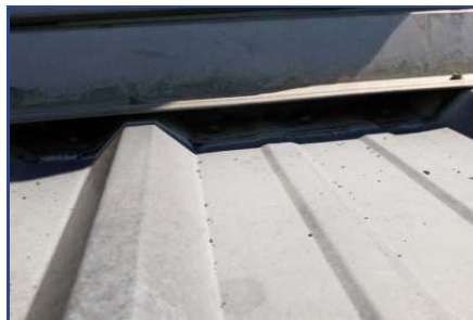
Section C - Deficiency #4 Foam gasket is deteriorated