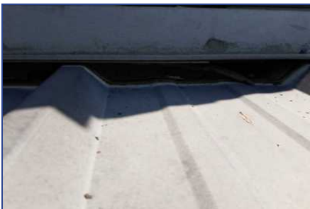
Section C - Deficiency #4 Foam gasket is deteriorated