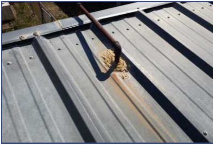
Section C - Deficiency #1 1" pipe coming through the roof is not flashed