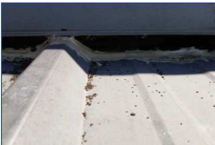
Section C - Deficiency #4 Foam gasket is deteriorated