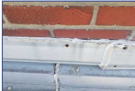
Section C - Deficiency #2 Metal flashing sealant deteriorated or missing