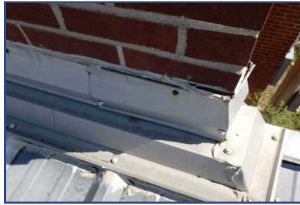
Section C - Deficiency #2 Metal flashing sealant deteriorated or missing