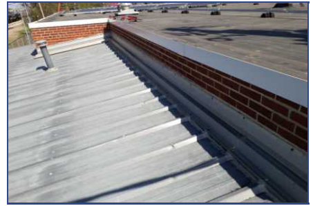
Section C - Deficiency #2 Metal flashing sealant deteriorated or missing