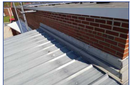
Section C - Deficiency #4 Foam gasket is deteriorated