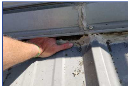
Section C - Deficiency #4 Foam gasket is deteriorated