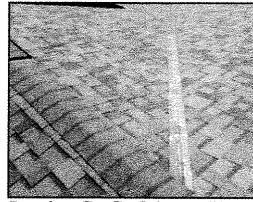
Section B - Deficiency #3 Deteriorated valley tin