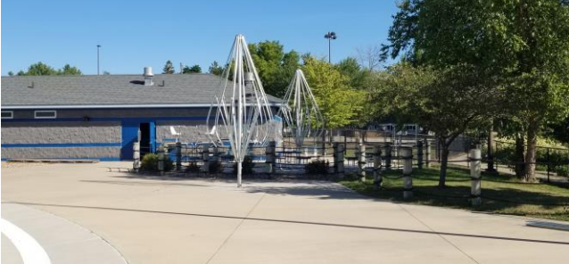
Platt Park shelter