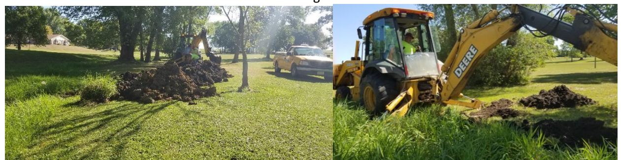
Ball fields Downtown Permabrealls