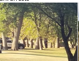
Platt Park arrests