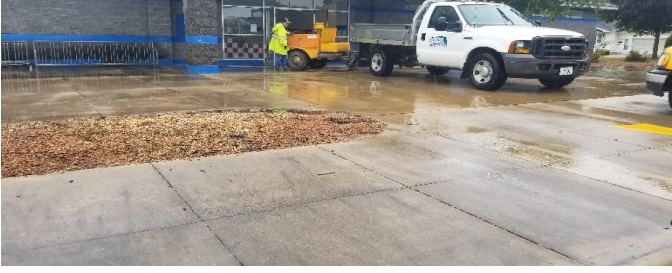
Woodlawn flag base