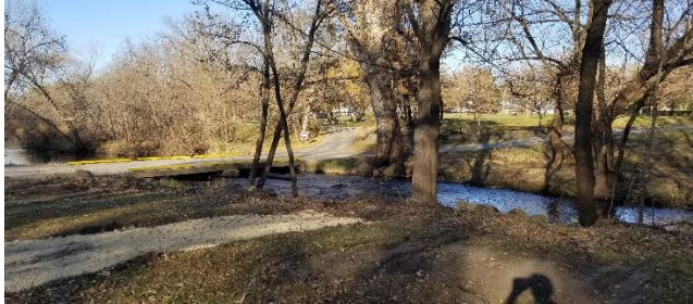
Disc golf work