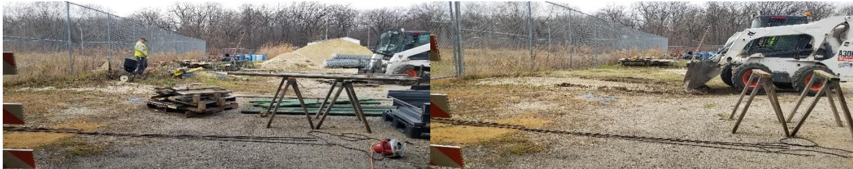
Cleaning up around the shop

TREES FOREVER Planting a better tomorrow™