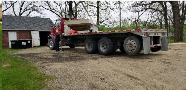
New Woodlawn Sign