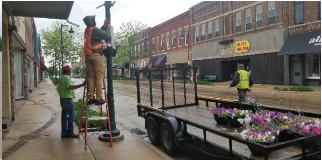
TRAILS GRANT SUBMITTED