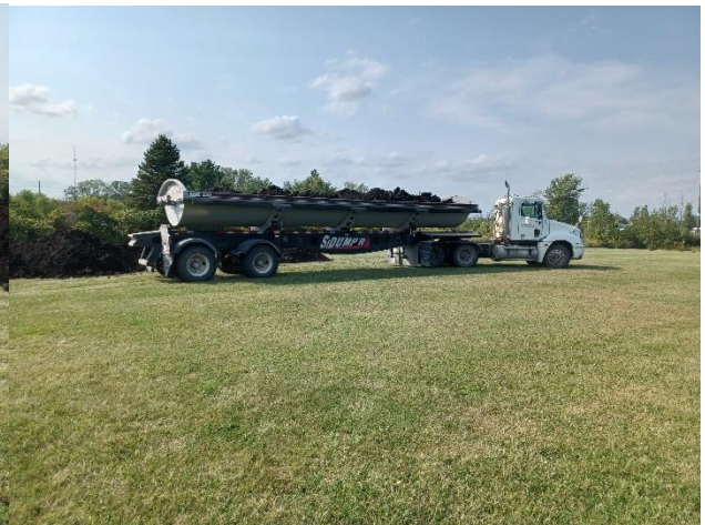
ASH TREE REMOVAL CITY PARK