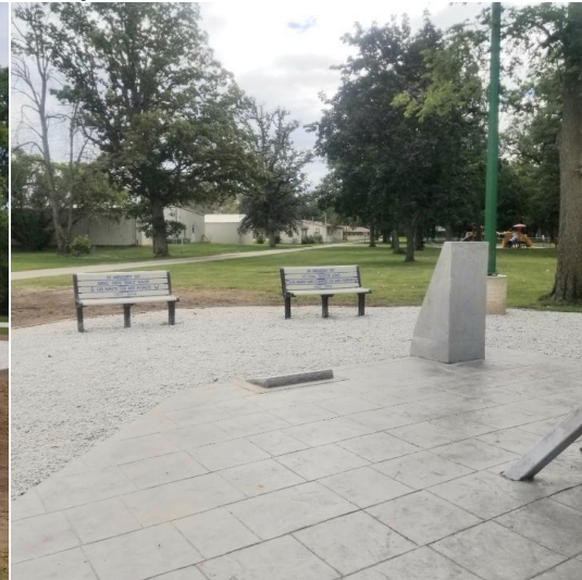
FENCE INSTALLED OAKDALE