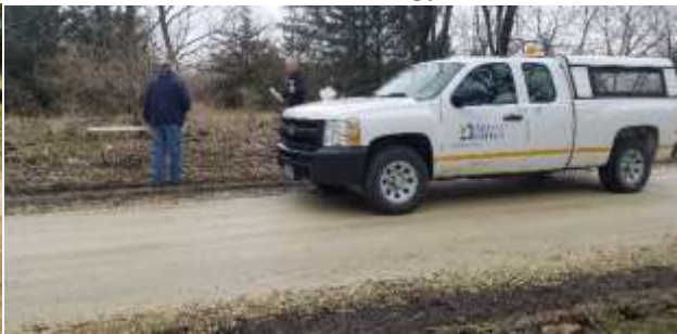
Alliant trenching electrical line