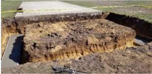
Red gate bathroom foundation