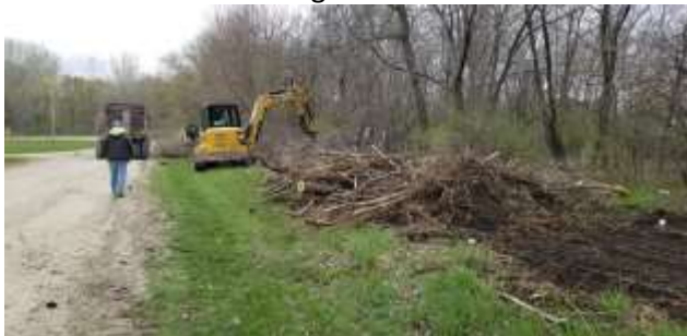
5 th street