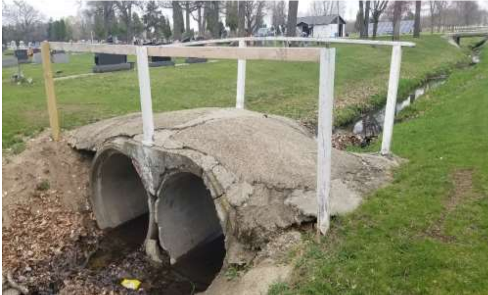
Bock 18 "bridge"