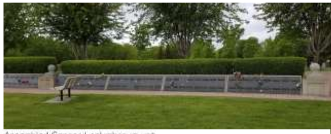
Assembled Concord columbarium unit

Project Description: Columbarium for cremains. $50,000.00