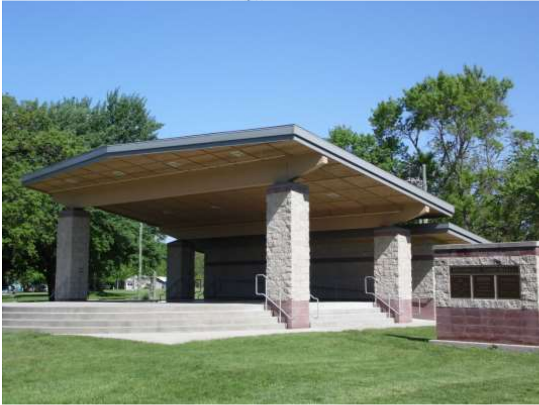
Potential new band shell