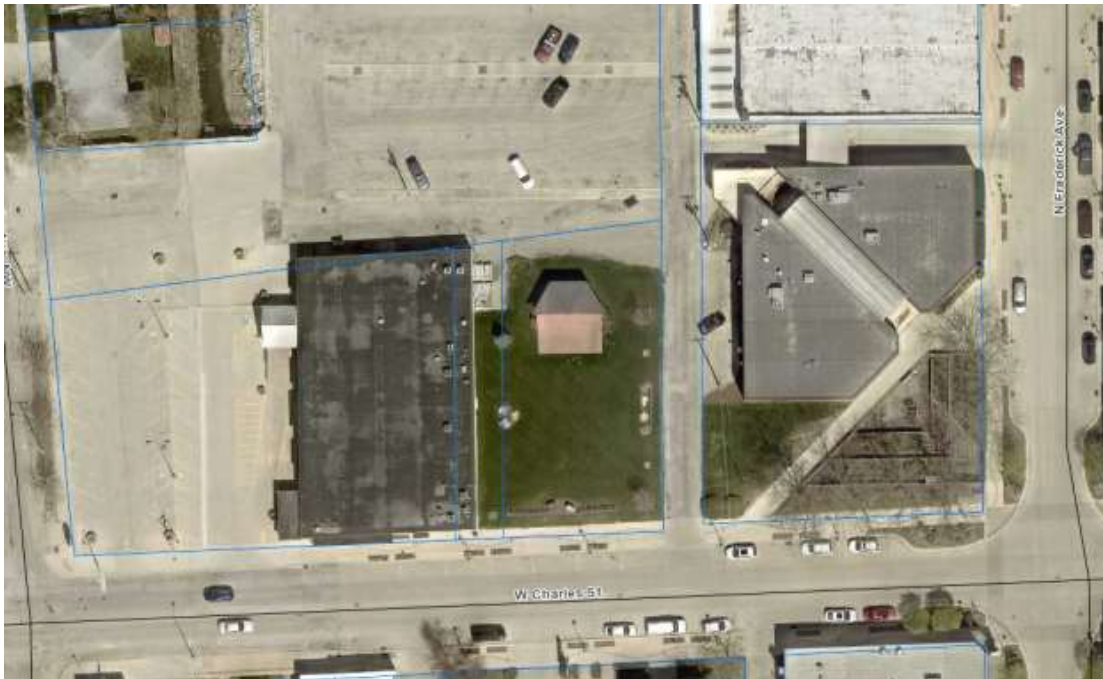
Existing Park Area