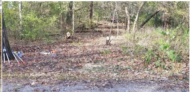
Continuing education classes