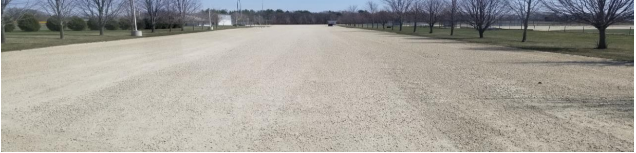
$4,000 trails donation