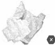
NO Loose Plastic Bags, Bagged Recyclables or Film Empty recyclables directly into your bin.