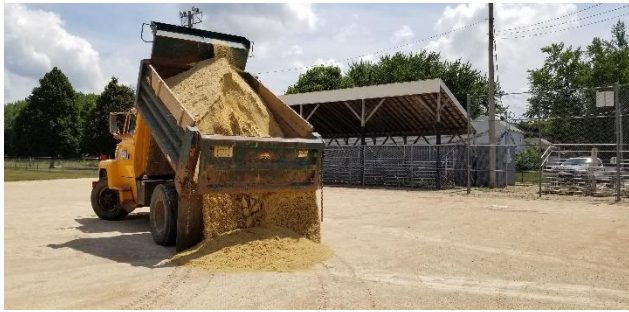
Diamond 1 flood cleanup