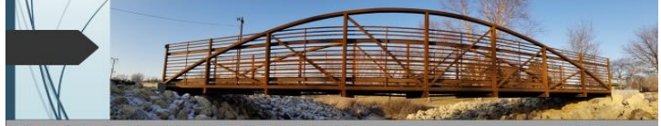
City of Oelwein Urban Trails Master Plan