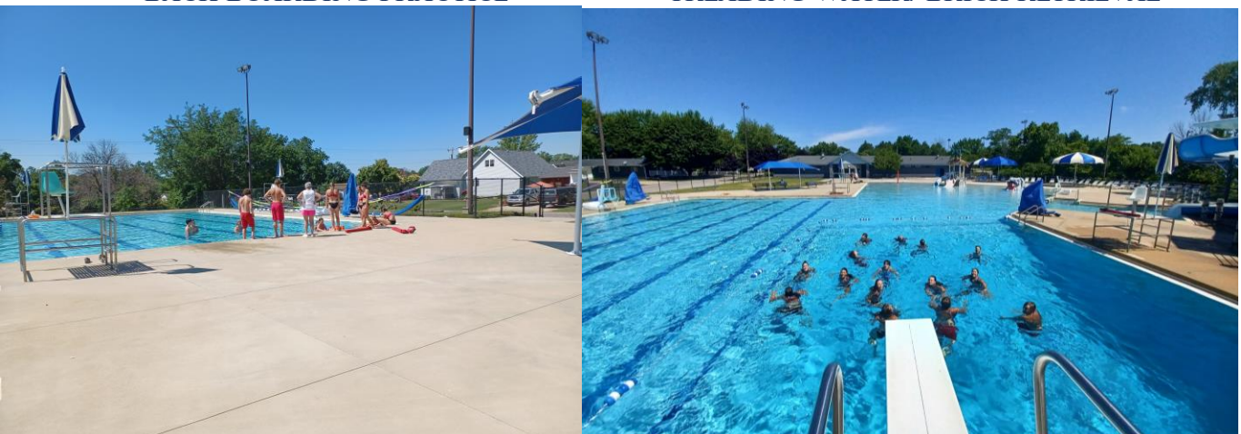
TREADING WATER/ BRICK RETRIEVAL