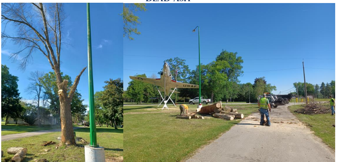
ASH TREE REMOVAL - WINGS