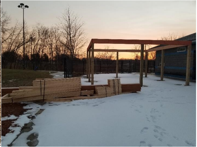
MINOR STORM DAMAGE