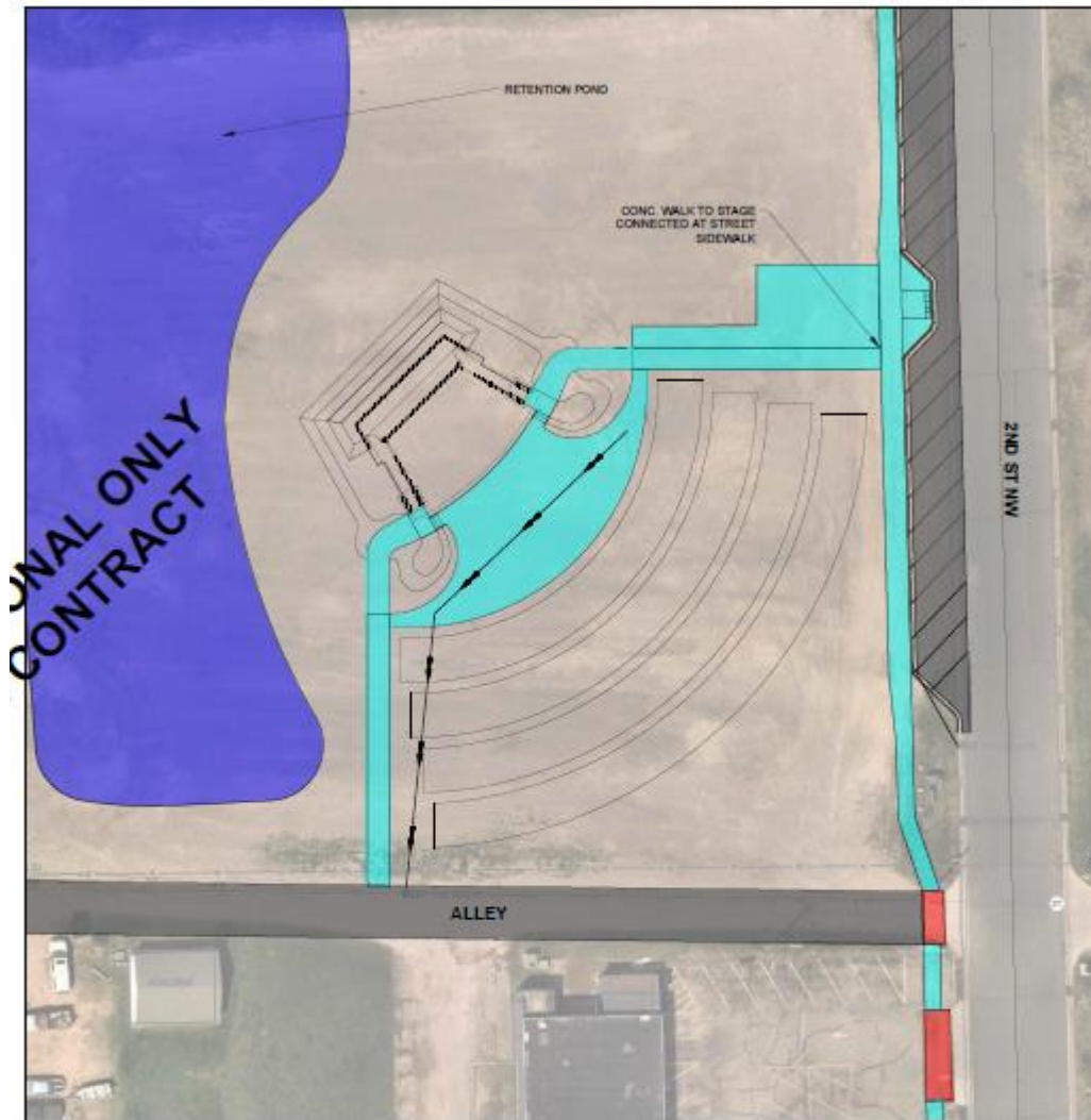
PHASE 3 CONCEPTUAL