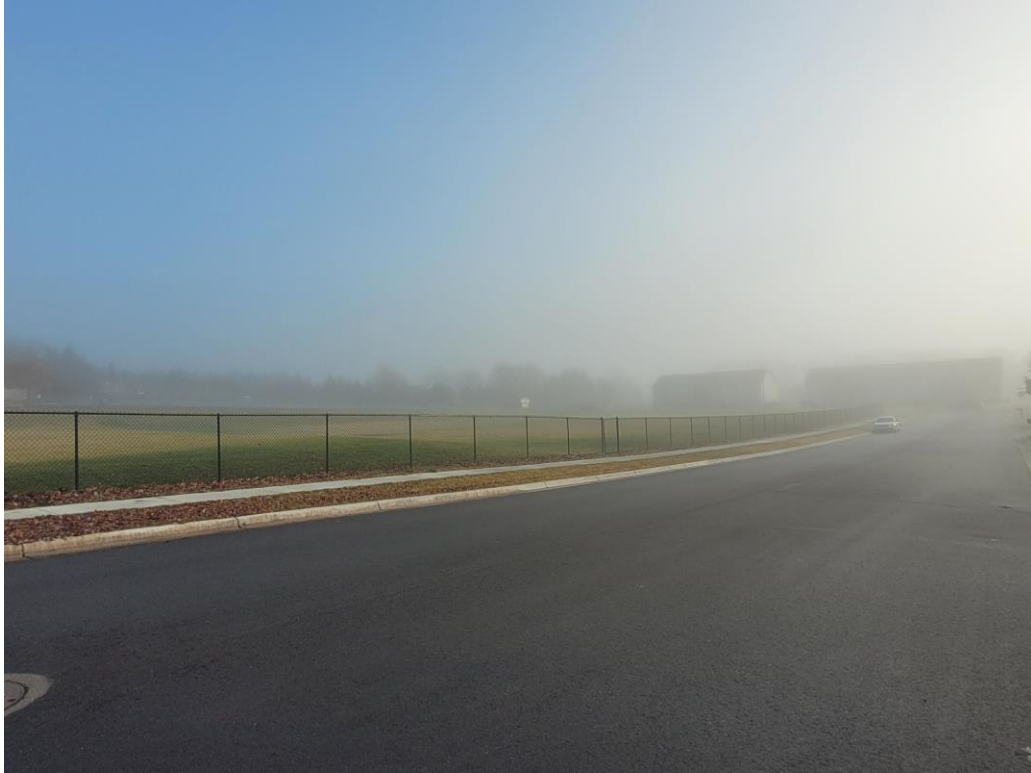
Existing Fence Looking North from 3 rd Street NE