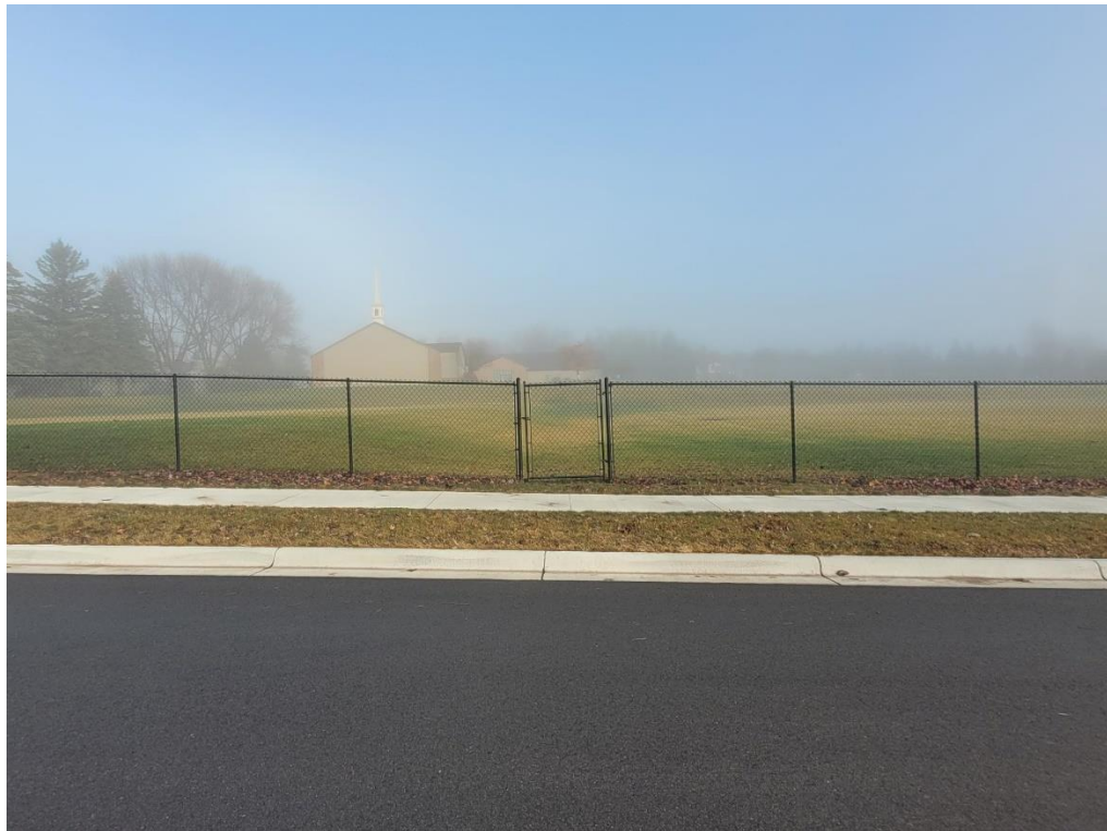
Existing Fence Gate Looking North from 3 rd Street NE