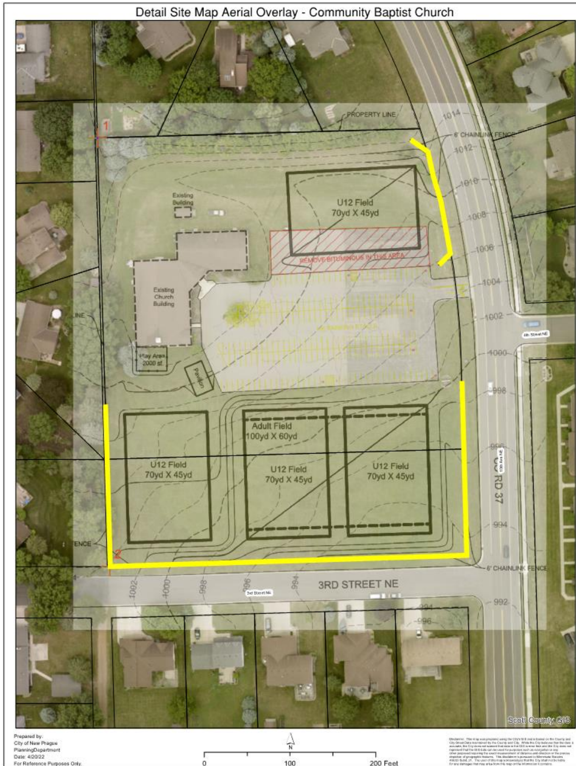
Map Showing the Fence Location – 4/20/22