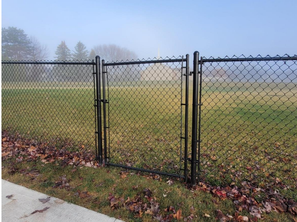
Existing Fence Gate