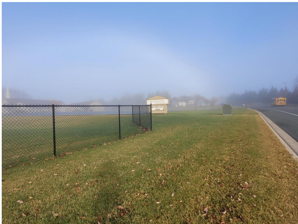
Existing Fence Looking Northwest from 10 th Ave NE