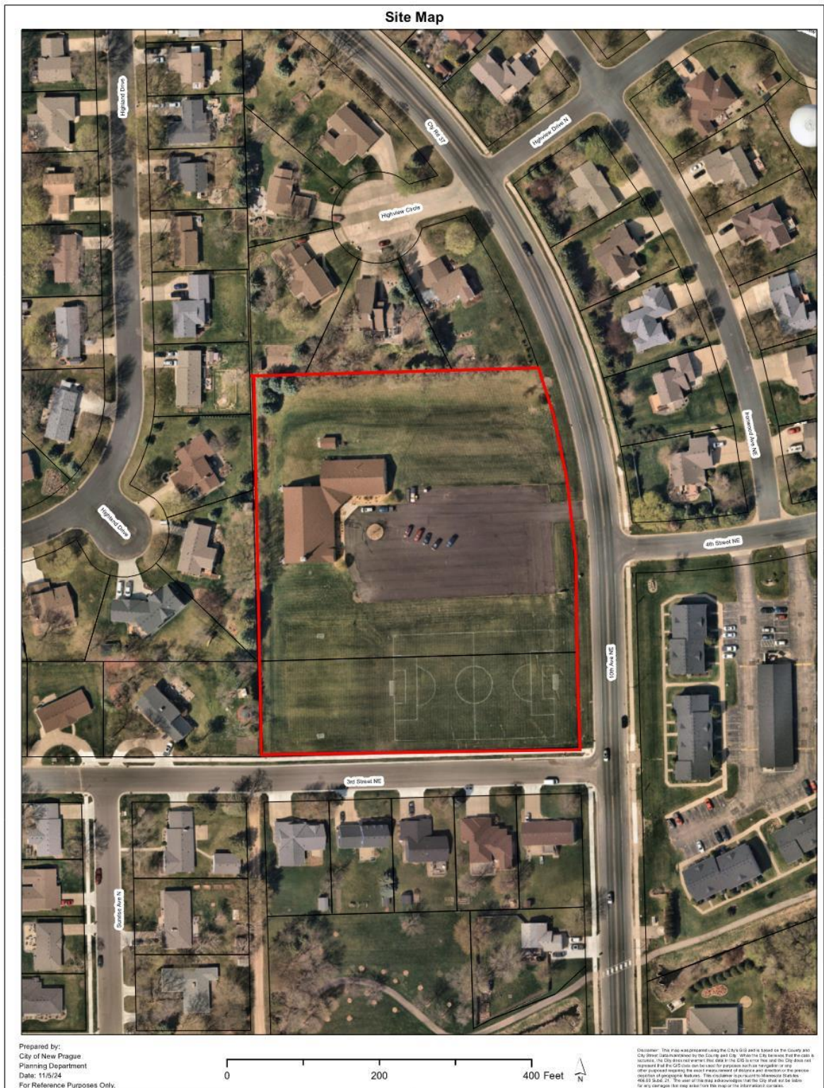
Aerial Site Map