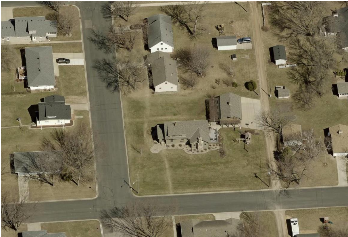
Oblique Air Photo Looking North