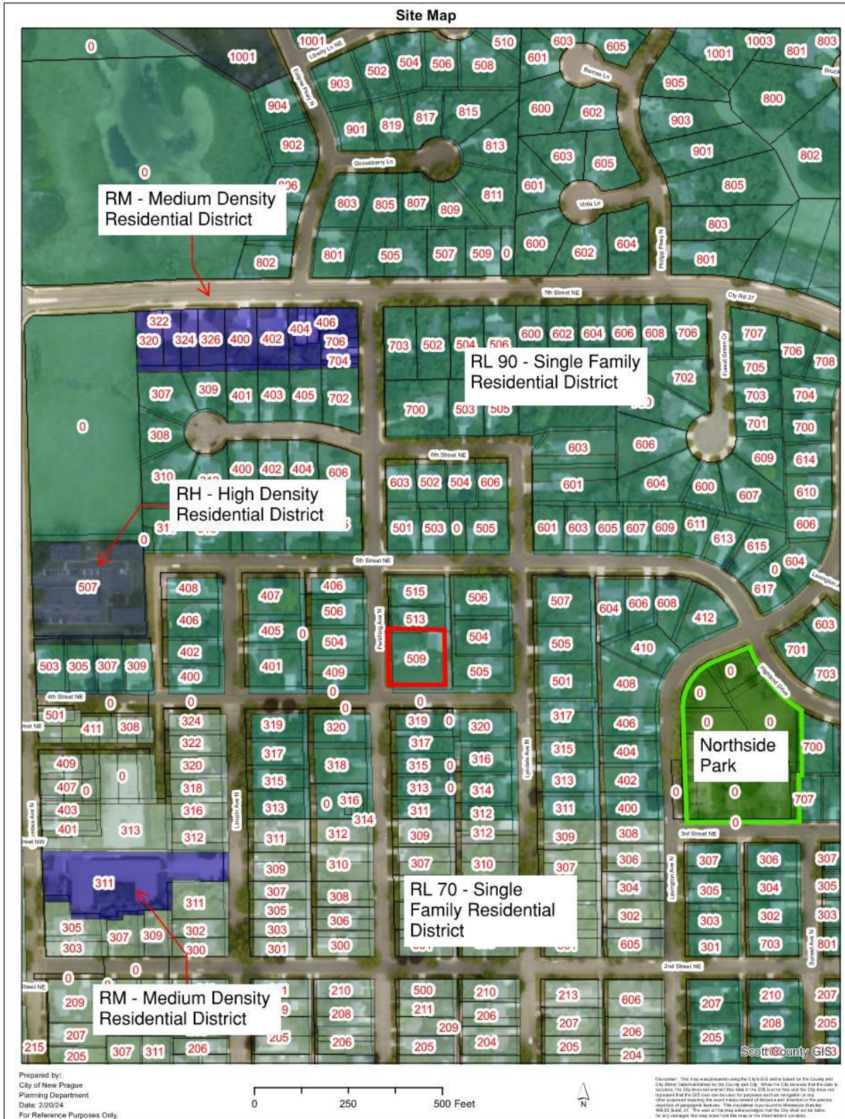
Zoning of the Subject Site and Surrounding Properties