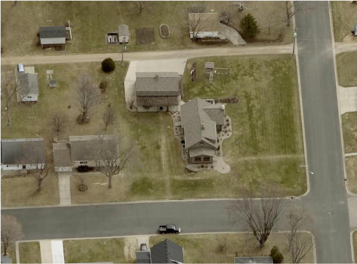
Oblique Air Photo Looking East