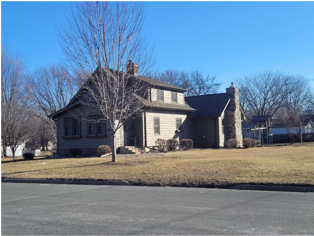
Looking East Along Pershing Ave N