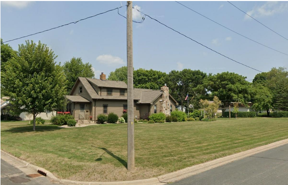
Looking Northeast of southern property line