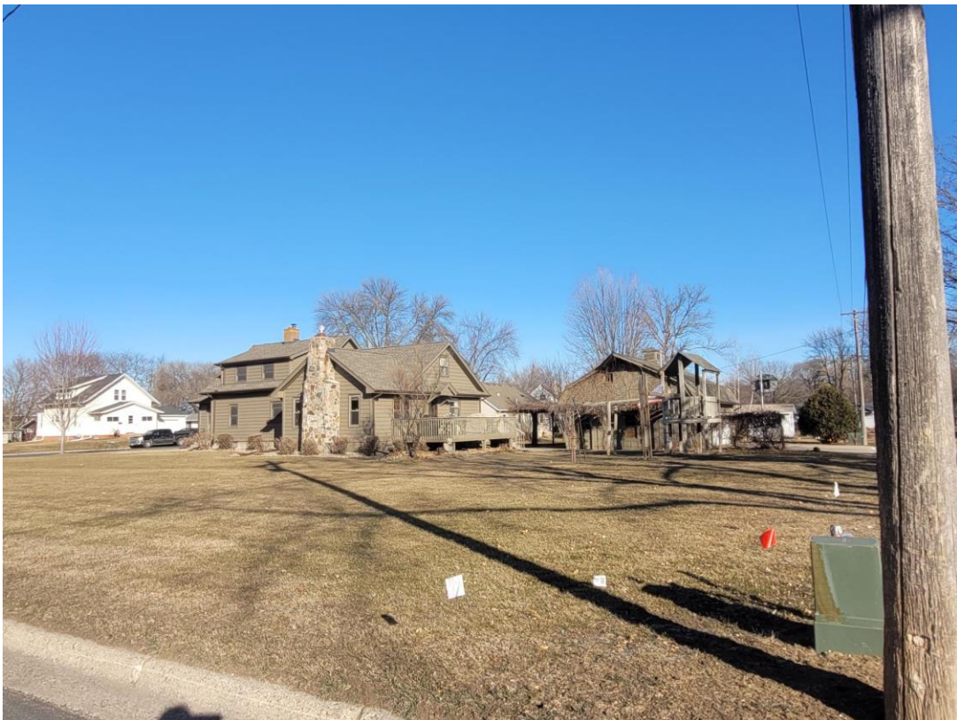
Looking North of 4 th St NE