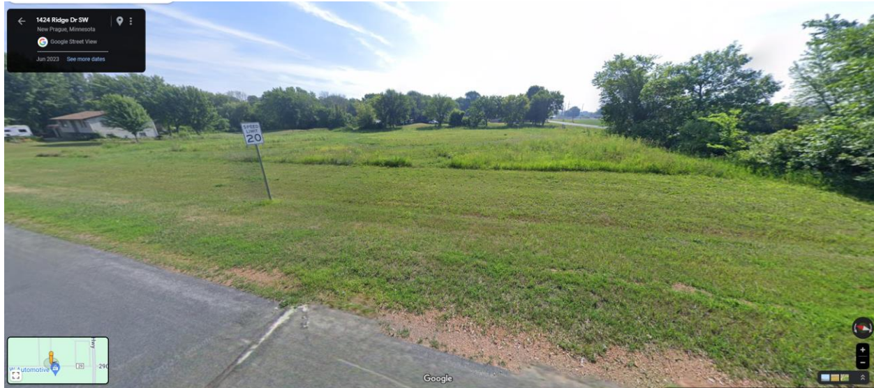
Looking East from Ridge Drive SW at area for the two new created lots.