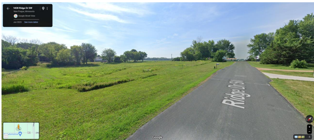
Looking SE from Ridge Drive SW - two new lots on the left side of the photo.