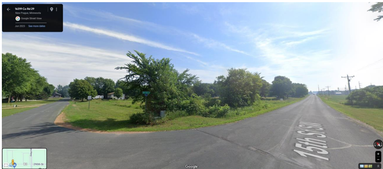
Google Street View looking NE from intersection of 15 th Street SW and Ridge Drive SW.