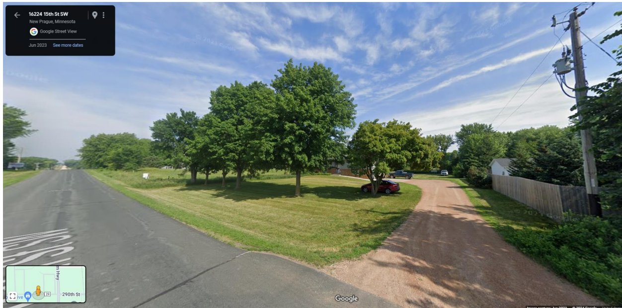
Google Street View looking south from 15 th Street SW looking to the NW.