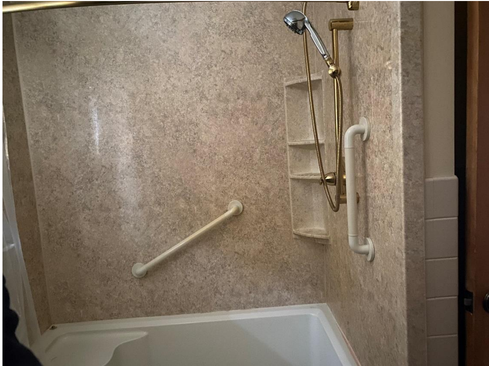
Interior of Subject Home (Bathroom)