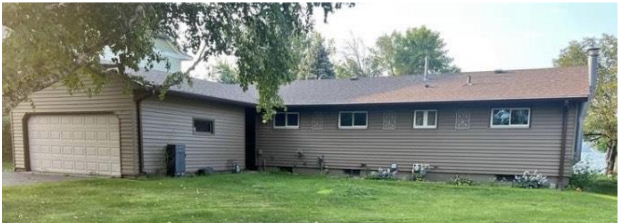
Exterior of the Subject Home (Back)