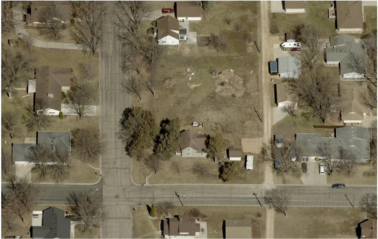
Oblique Air Photo View of Vacant Lot