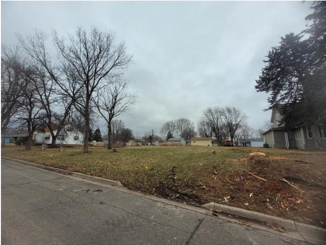
Current Vacant Lot