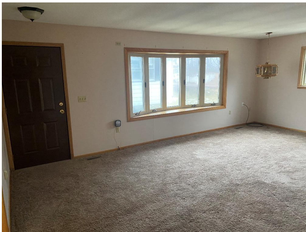
Interior of Subject Home