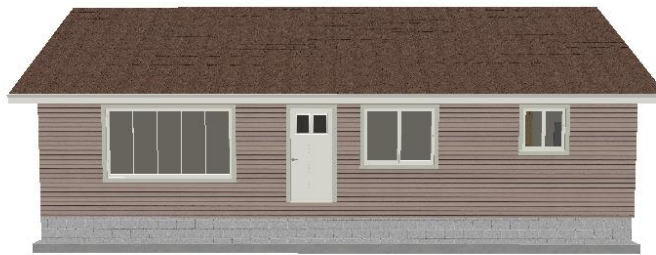
Proposed Exterior of Subject Home (West Elevation)