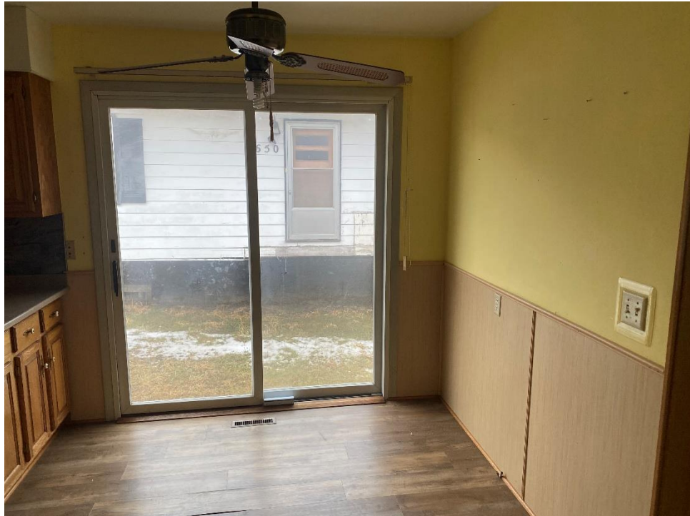
Interior of Subject Home