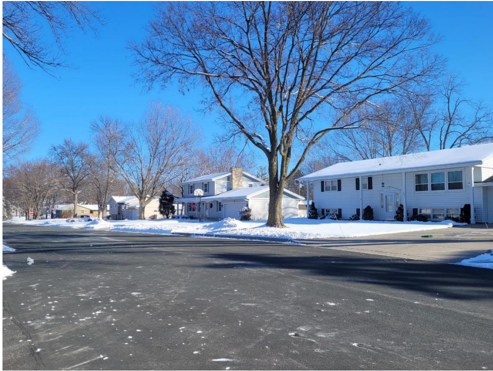
Neighborhood Homes Built in the 1960s-70s (Along Lyndale Ave N)