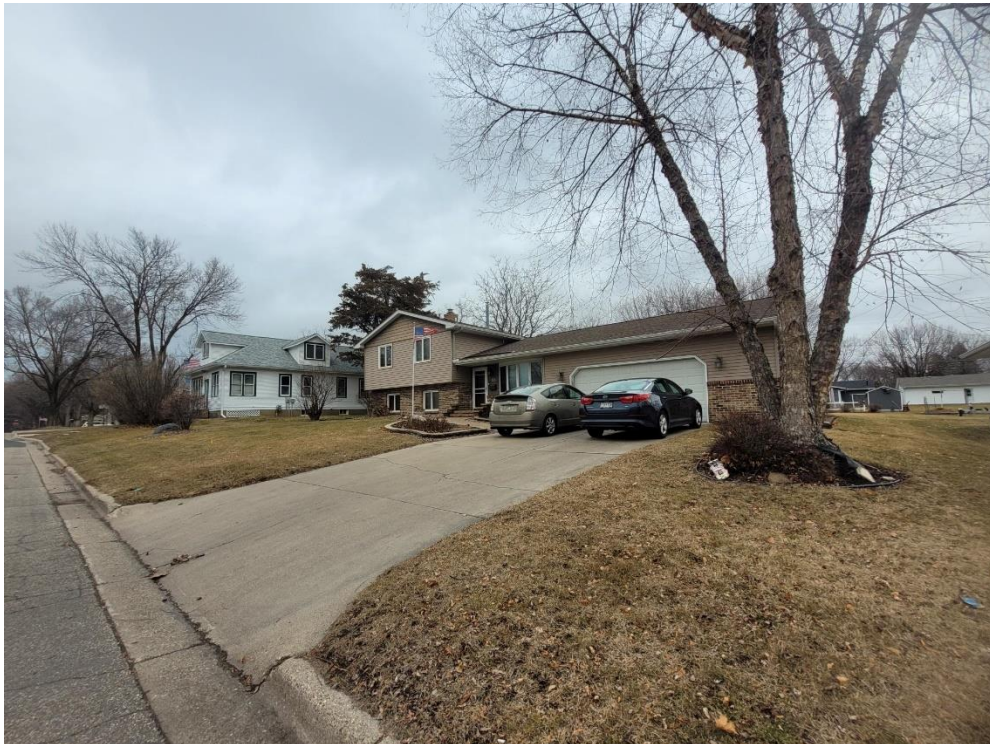
Home to the North (Built in 1980)