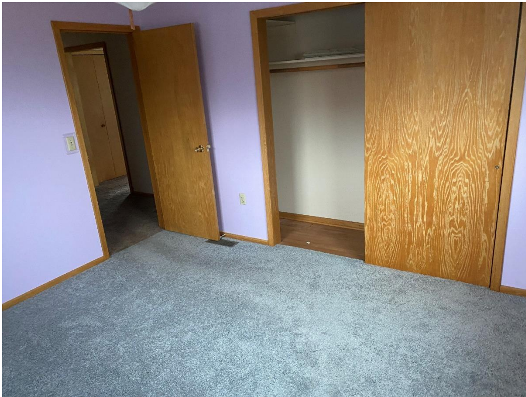
Interior of Subject Home (Bedroom)