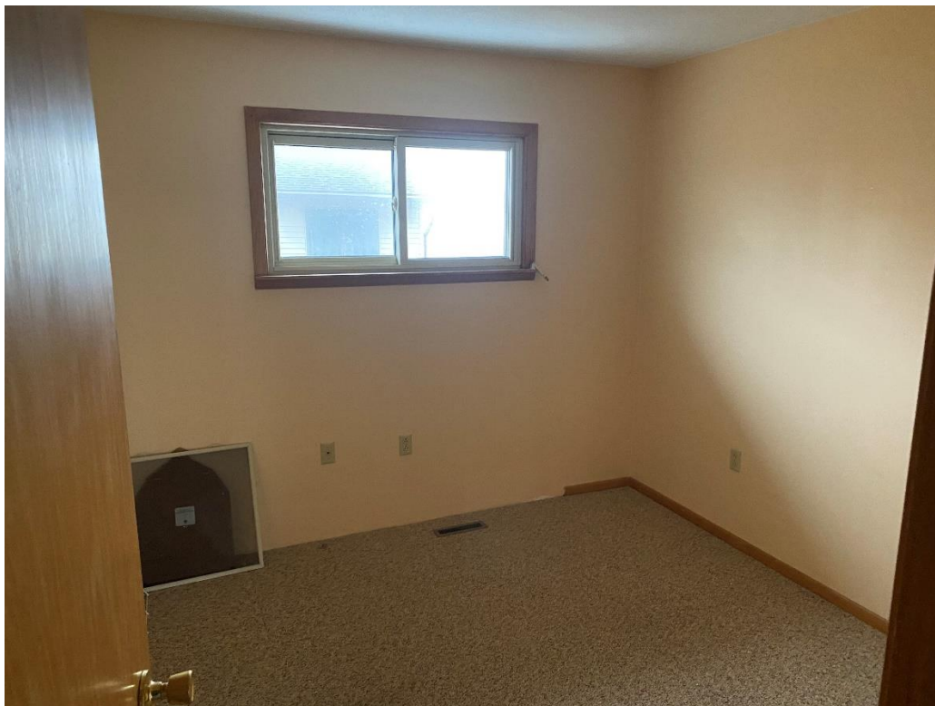
Interior of Subject Home (Bedroom)