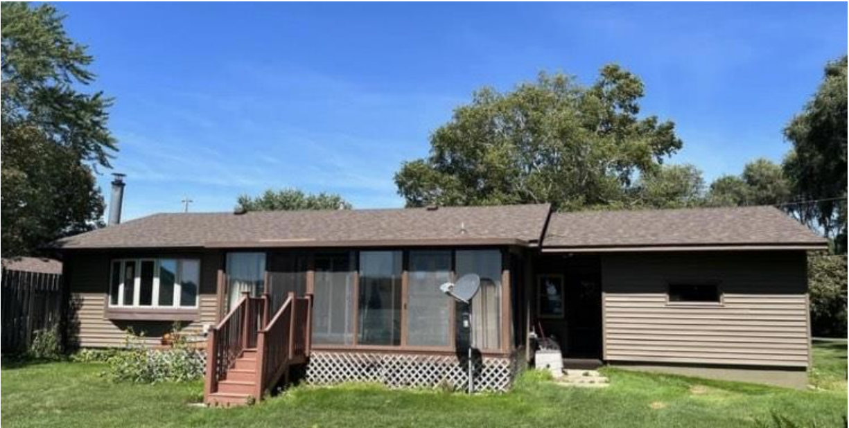
Exterior of the Subject Home (Front)