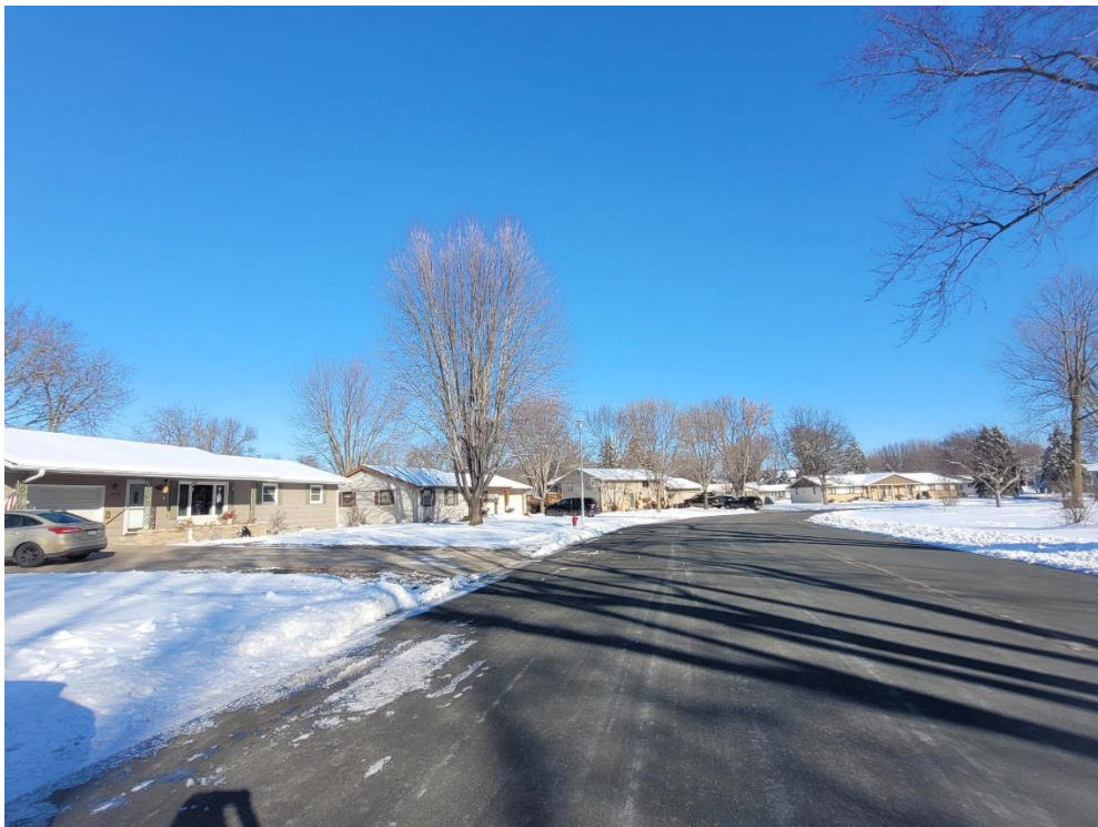
Neighborhood Homes Built in 1960s-70s (Along Lexington Ave N)