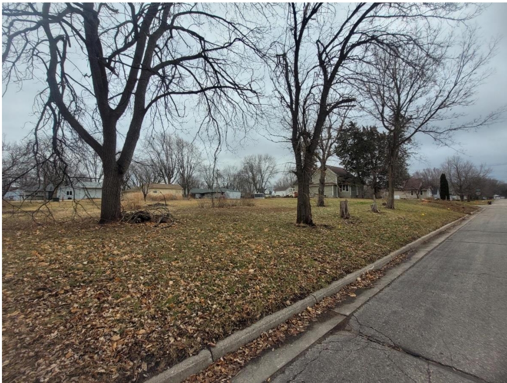
Current Vacant Lot