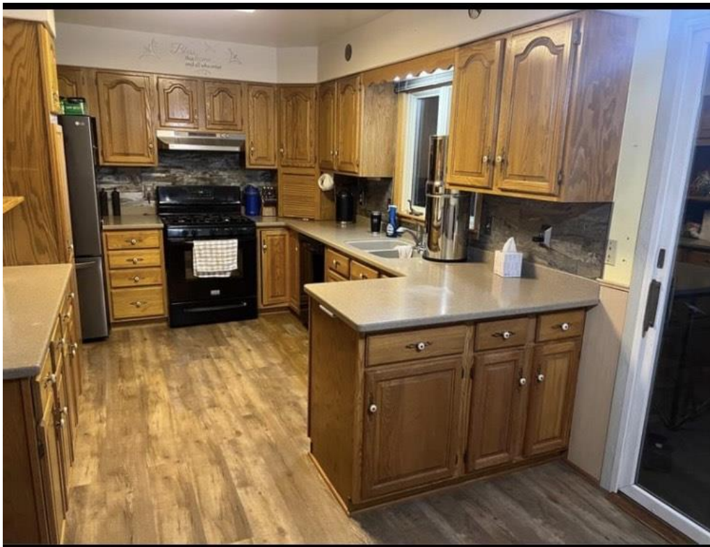
Interior of Subject Home (Kitchen)