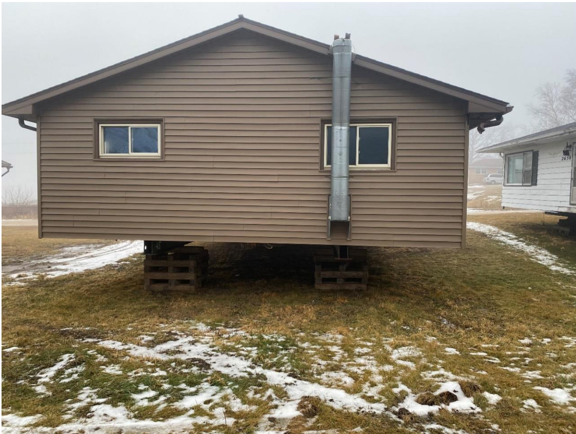
Exterior of the Subject Home (Side)