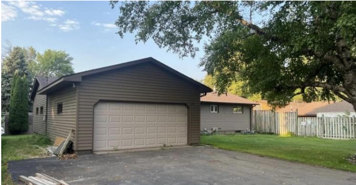
Exterior of the Subject Home (Garage)