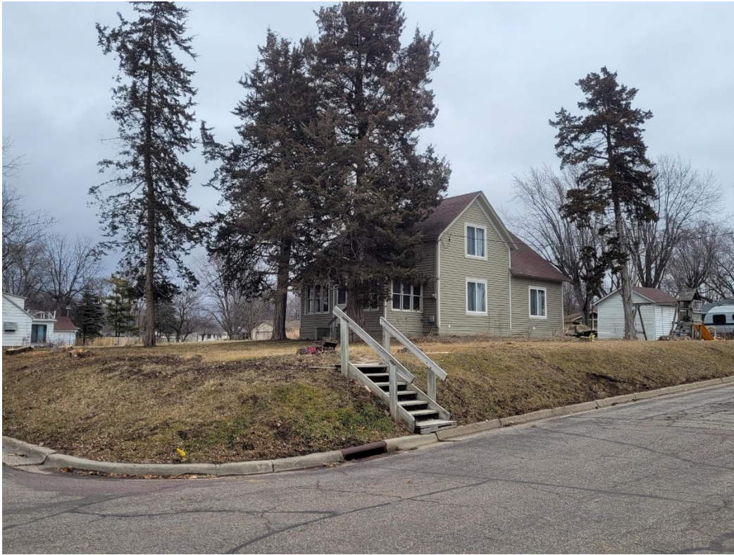
Home to the South (Built in 1890)