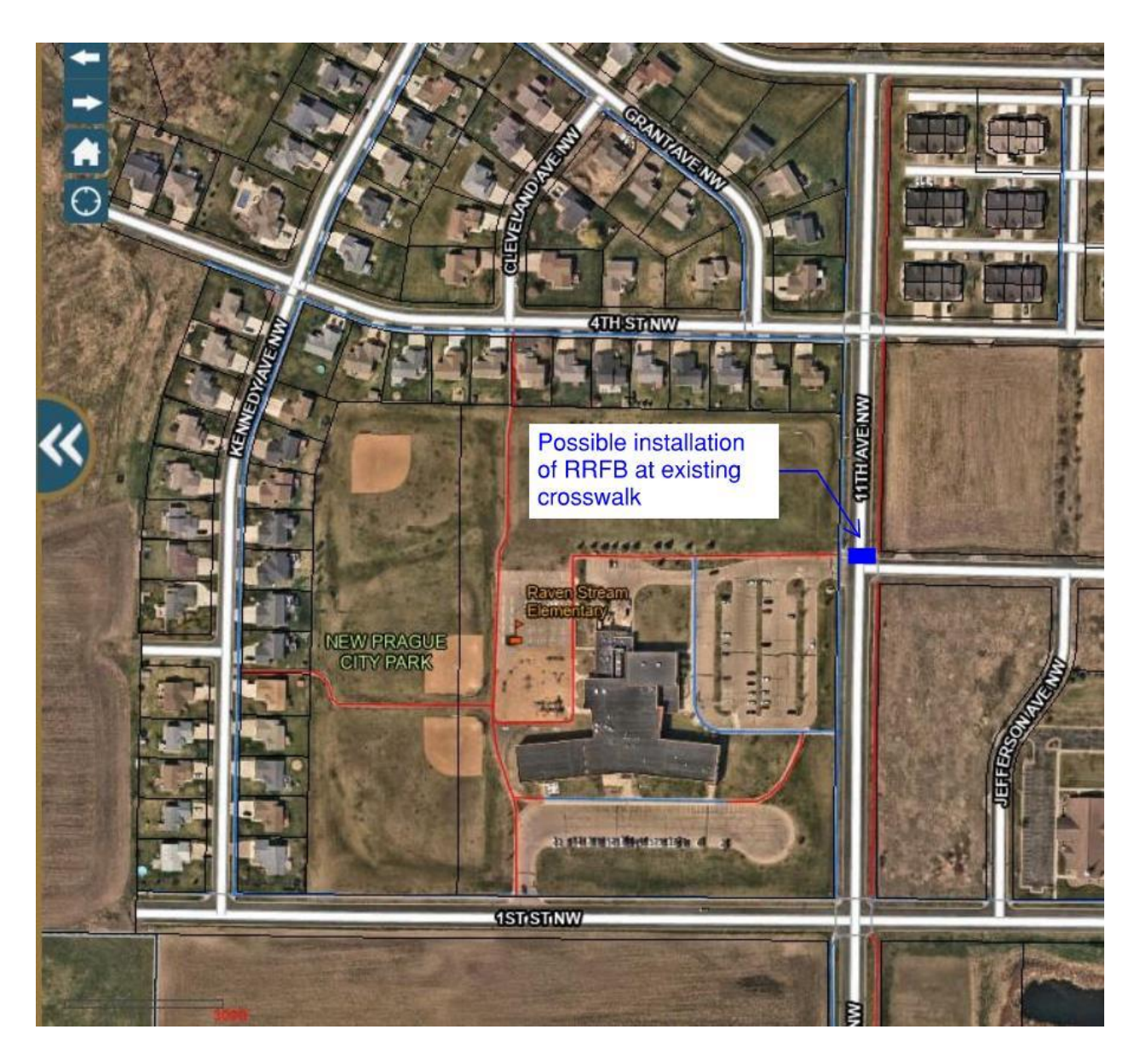
Proposed Improvement Near Raven Stream Elementary School