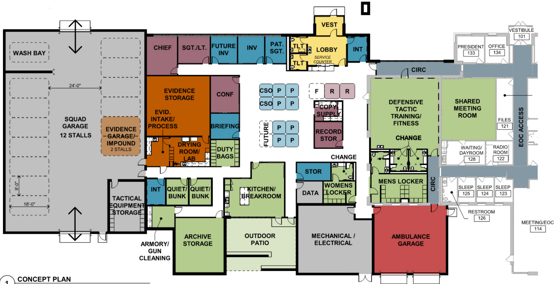
1 CONCEPT PLAN 1/16" = 1'-0"