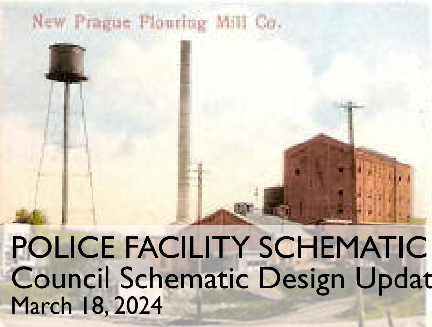
New Prague Flouring Mill Co.