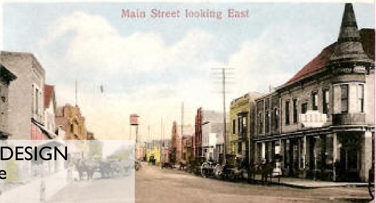
Main Street looking East

POLICE FACILITY SCHEMATIC DESIGN Council Schematic Design Update March 18, 2024