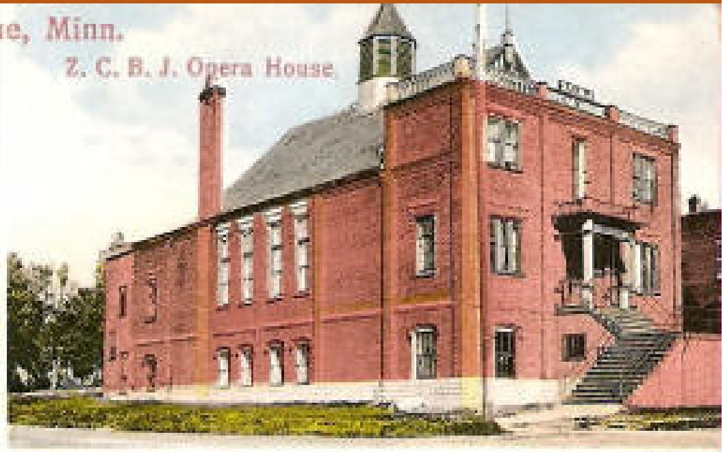
Z. C. B. J. Opera House