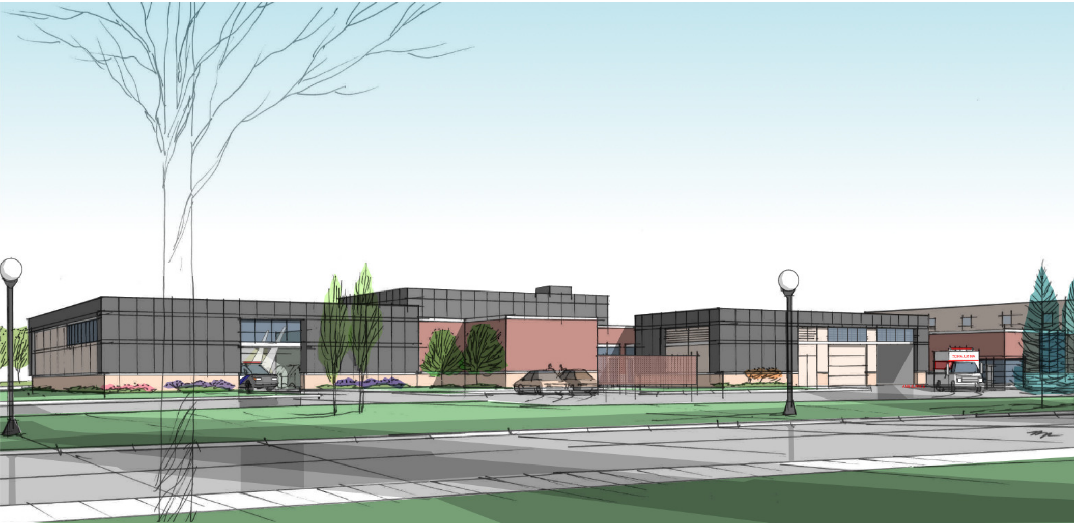
Concept Sketch (View from 4 th Ave. NW/ HWY 21)