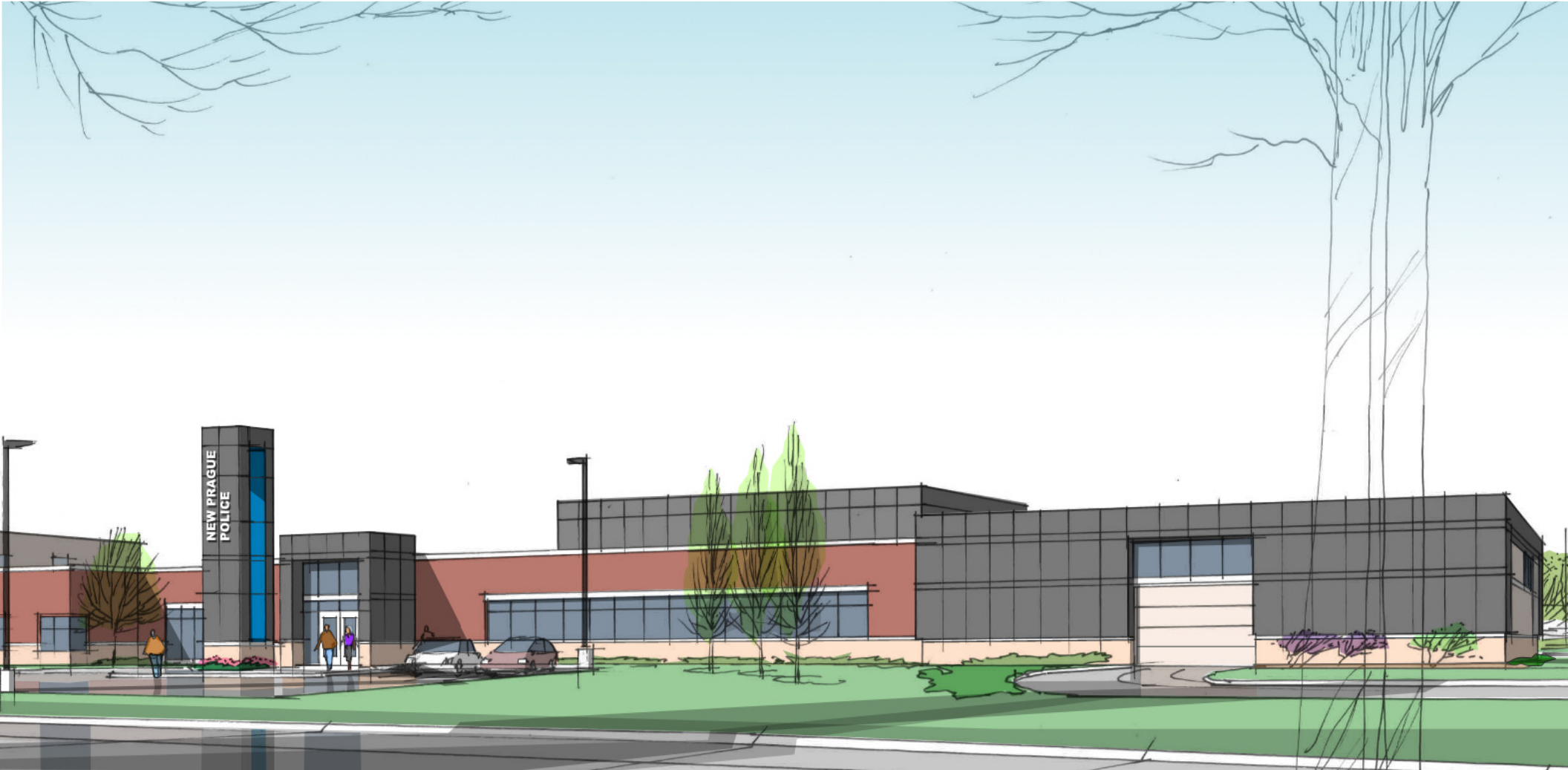
Concept Sketch (View from 5 th Ave. NW)